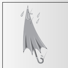
National Umbrella Month