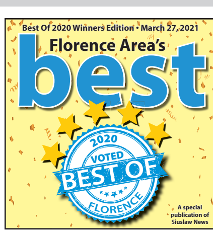
SPECIAL SECTION INSIDE!