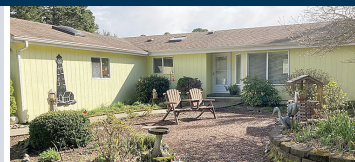
4854 SEAPINE DRIVE

Vintage Charmer. Charming 1907 home located in the heart of Old Town District. Beautiful views of the Siuslaw River, boardwalk and bridge. 4 bedrooms, 2 baths in 2487 SF of living. Bay windows, landscaped yard, deck, carport and storage garage. Built-in wall clock and Barber pole included. All appliances stay. Come see this one before it's gone. $539,000 #12126 MLS#21666570