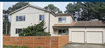
88505 3RD AVE

A big open room concept and bright space in the heart of Mapleton. The public dock is right near your back door. Enjoy beautiful views of the Siuslaw River and Forest. Conveniently located right next to the store, restaurant, and local businesses. The house has been beautifully maintained with a recently upgraded kitchen. Master bedroom/Private En Suite bathroom is on the opposite side of the other bedrooms. $340,000 #12130 MLS#21269558