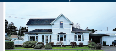
1613 1ST ST.

Newly remodeled throughout, this fabulous beach house is perfect for full-time living or would make an ideal vacation rental. No HOAs. Ocean views & a short walk to beach access. This spacious home w/ oversized double garage offers lots of room for family, friends & toys. Large fully fenced yard & room for RV parking. Open concept, all new interior paint, LVP flooring, quartz counters, 2 ensuites-1 upstairs, 1 down w/ new walk-in shower. Huge bedroom/bonus room w/ wave-breaking views. Must see! $695,000 #12140 MLS#21049463