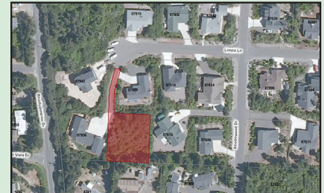
Limpit Lane #228 – Excellent building site in this quiet neighborhood with paved streets, electrical, water hook-ups at the lot line, and septic approved. Wooded lot priced at $75,000. #1541-14427123