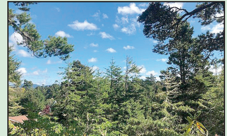
91 Windleaf Way – This is a great opportunity to build your home close to the beach, in a great community of very nice homes. $63,000. #2797-18615048