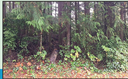
Cedar St #800 – Nice corner lot south of Florence near dunes, beach and town. Paved roads to this wooded lot with lots of possibilities. Quiet neighborhood with nice, newer homes around. Needs cleared and developed, so bring your ideas. Priced to sell! $29,900. #2785-17017018