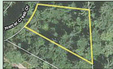
Mercer Creek Dr #00148 – Nice, wooded .32 acre lot near Sutton Lake in an area of fine homes. This wonderful North Lakes area lot is waiting to be developed and built on. Property has mature trees and native vegetation. Water and power available. $64,900. #2597-16420336