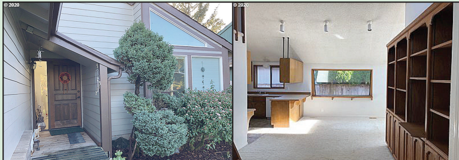
1040 8th St – This 4 bdrm, 3 bath home has a master suite with walk-in closet, new range and dishwasher, built-in library shelving, and dining area garden-window. Newly painted decking out back, plus gazebo and hookups for a future spa. $399,000. #3160-20472482