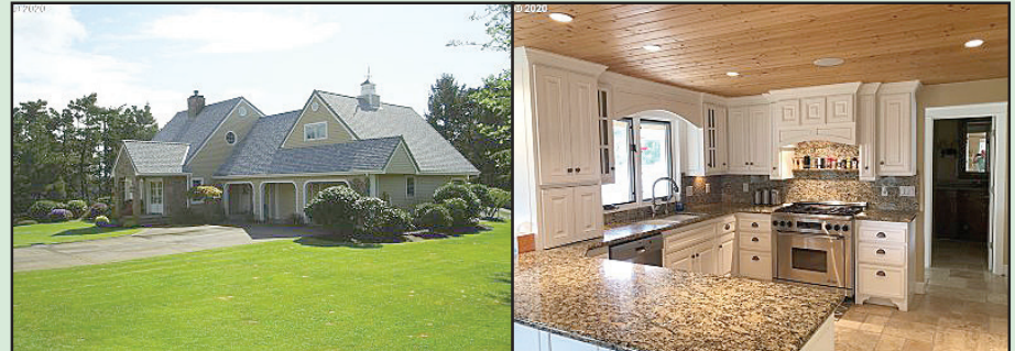
28 Ocean Dunes Dr – Custom Cape Cod home with views of the 18th green. Great room with pass-thru fireplace from kitchen to den. 2 master suites and guest room with full bath, home theater and rec room. Lot 27 is included and is the last buildable lot in Ocean Dunes. $950,000. #3124-20557608