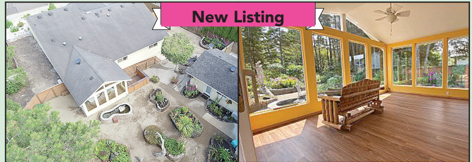
4104 Munsel Creek Dr – Two separate homes! Main 3 bdrm, 2 bath, 2340 sqft home, thoughtfully remodeled with accessibility in mind. Newer, secondary home offers an additional 1,676 sqft with 2 bdms and 1.5 baths. Abundant parking and storage, plus a stunning garden. $700,000. #3186-21117076