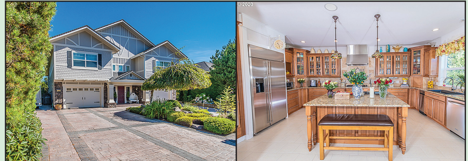
1035 Royal St Georges Dr – Fairway frontage and solid, well built home with great golf course views. This home is full of luxury amenities including stainless appliances and gas range, propane fireplace, an elevator, media/theater room, and expansive Trex deck overlooking the green. $850,000. #3137-20502246