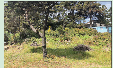
4th Avenue #106 – Nice beach area lot with water and power services at the lot line. With a little clearing this lot could be ready for your new home. Walking distance to the beach and minutes to town. Bring your toys and enjoy your little gem on the coast! $55,000. #2995-19651615