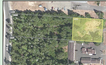
3959 Hwy 101 – Commercial opportunity with Highway 101 frontage located in the North Florence commercial district. Highway District zoning allows for many different uses. $249,000. #2703-17034510