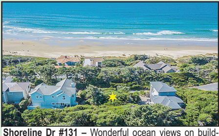
Shoreline Dr #131 – Wonderful ocean views on buildable land in the Kila-Ha-Nee development. A private gated community of high-end oceanfront and ocean view houses. Walk to the ocean, breathe the fresh air, and take in the natural beauty. Utilities at the lot line; septic approved. $275,000. #3138-20332598