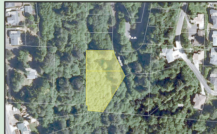
Maple Lane #6 – Buildable, private lot in Rhodo View Dunes Estates. Build your custom home in this gated subdivision with all city services. Possible seller terms. $19,995. #2210-13084475