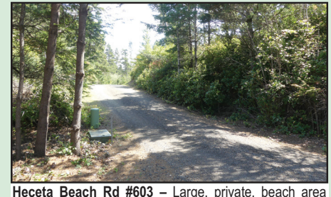
Heceta Beach Rd #603 – Large, private, beach area wooded lot. This elevated cul-de-sac location is only minutes from the beach and town. Power and Heceta water available, septic approval, located in Heceta Lake Estates. Manufactured homes OK. $94,500. #2834-18411160