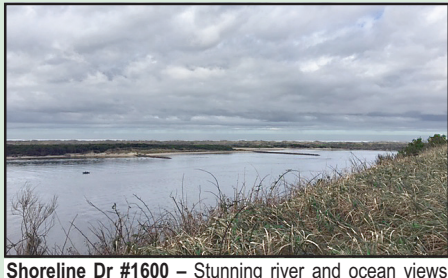
Shoreline Dr #1600 – Stunning river and ocean views from this cul-de-sac lot in gated Shelter Cove. Build your dream home with underground utilities, city water and sewer available. Level and cleared with end-of-road privacy. An engineer's report is on file as well as a home plan. $179,000. #2664-16013673