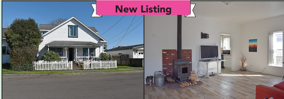
238 Oak St – Fantastic location in Old Town and just a block from the river! Home features 3 bdms, 2 baths, plus 2 bonus rooms for a total of 5 possible bdms! Bring your ideas and turn this unique, turn of the century home into your home or an income property. $359,000. #3181-21194032