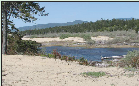
Lake Point Dr #69 – Cleared and level 1.74 acre lot in the Reserve, overlooks seasonal lakes, dunes and nature preserve areas. Quiet cul-de-sac location in development with underground utilities and Heceta Water. $100,000. #1715-9023646