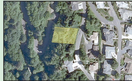
Ocean View Dr #11 – Buildable lot with spectacular views in Rhodo View Dunes Estates. Build your custom home in this gated community with all city services. CC&Rs ensure that all homes will be stick-built with a minimum of 1,350 square feet. $25,000. #2206-13021717