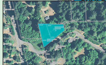
5285 Herman Cape Rd – Two for the price of one! Two tax lots in the sought after Herman Cape neighborhood. Minutes from the beach and downtown Florence. Bring your ideas and build your dream home! $90,000. #3151-20605666