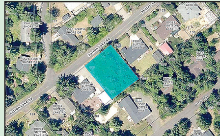
Sutton Lake Rd #127 – Nice .30 acre lot near Sutton Lake in a great neighborhood. This wonderful North Lakes area lot is waiting to be developed and built on. $57,500. #3049-19202450