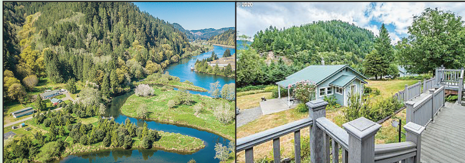
9700 Bernhardt Creek Rd – Country estate along Sweet Creek in Mapleton! Features two homes, gardens, fruit trees, barn, and private dock. Main home is 3230 sqft with an infinity pool and large wrap-around decks. The cabin comes fully furnished and is 940 sqft. $989,000. #3121-20170603