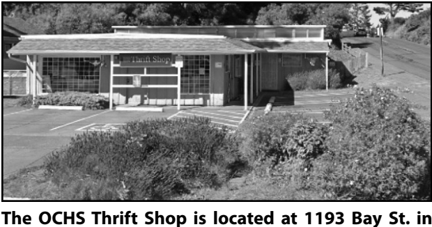
Historic Old Town Florence,.

People will find everything from new and gently used clothing, household goods, tools, furniture, appliances and more.