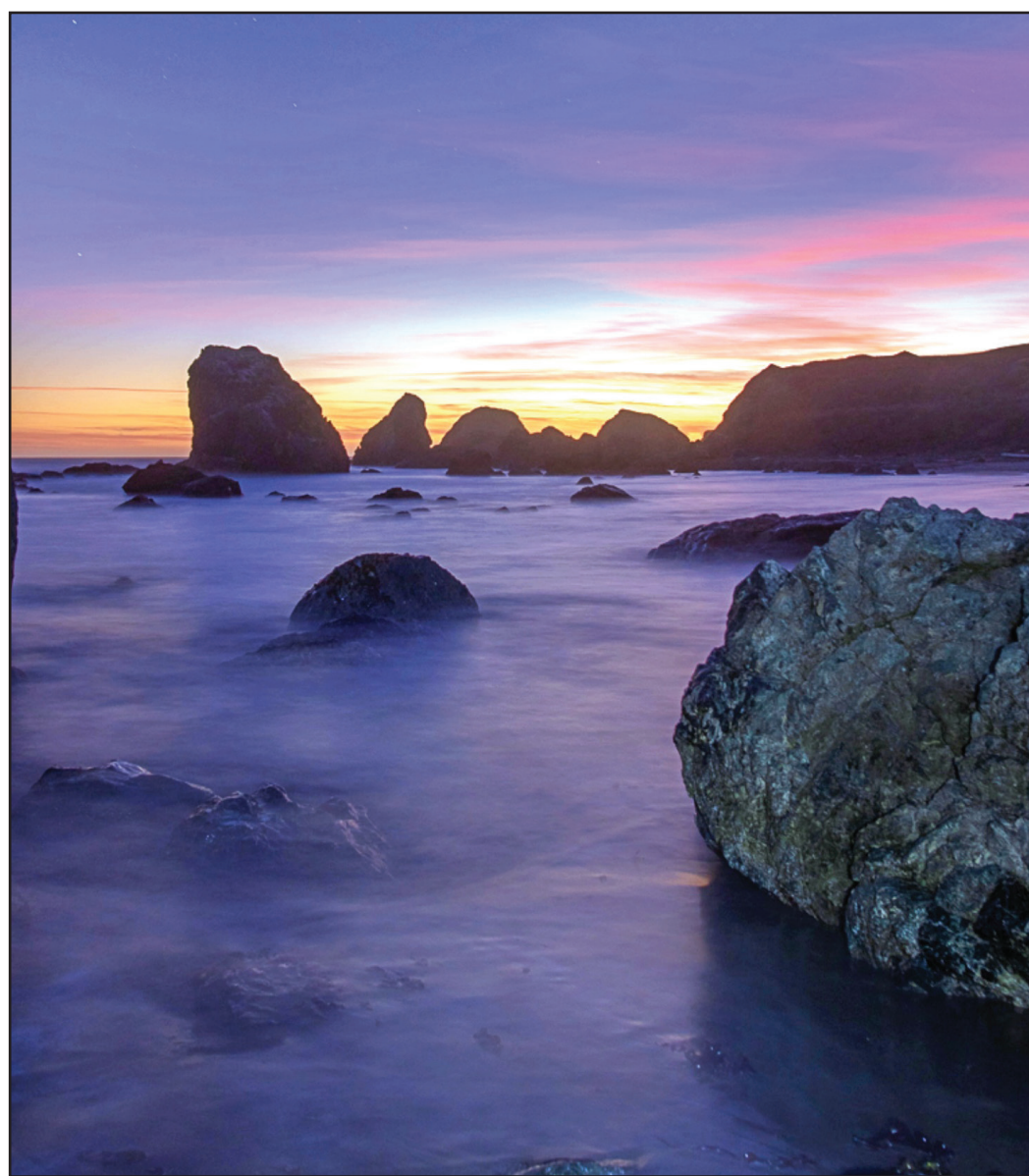
First-place photo "Days End" by Jim Buch was the winner of February's Siuslaw Viewfinders Camera Club photo contest, which was themed "Water in Nature."