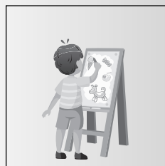
Youth Art Month