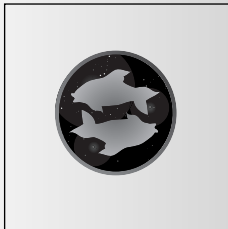
Pisces, The Fish (2/19-3/20)