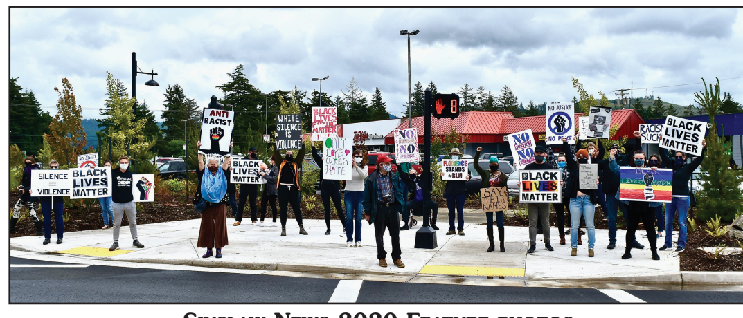
SIUSLAW NEWS 2020 FEATURE PHOTOS