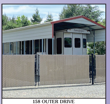
Relax and enjoy this private sunny outer lot in a gated community. Pristine and beautiful 2016 park model travel trailer with all the bells and whistles. Large workshop, tool shed, and lovely enclosed patio area, all surrounded by perimeter fencing. A must see! $199,900 #12029 MLS#20229642

Pet owner's dream house in the country! Kennel area, puppy gates, office area, pet tub, kennels & fencing. Only 14 minutes to Florence per Google. This home has a triple filtered water system. The kennel area has heated concrete floors & can be converted to a family room. The detached bonus room was built with almost double insulation. The viotime and warm in the winter. The finished attic has a ton of storage. Book your appointment to view the many possibilities. §249,900 #12032 MLS#20024499