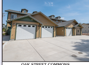
OAK STREET COMMONS New Townhomes! Great room open floor plan, stainless appliances, quartz counters, Medallion Cabinets. Ductless heat pump, waterproof laminate & carpeting. Covered deck & balcony. Attached finished insulated garage. Interior laundry closet. The escrow will close with the issuance of Occupancy Permit. Currently under construction. Showings by appointment ONLY. $279,000 #12090 MLS#20155771

692 SKOOKUM DRIVE This two-bedroom, two full bath home located in the heart of town is vacant and move-in ready. Great starter home or rental. Large lot with offstreet parking and room for a garden or outdoor living. 4FT x 8FT toolshed, 600 SF deck is fully railed and backs up to greenery. $192,500 #12112 MLS#20121187