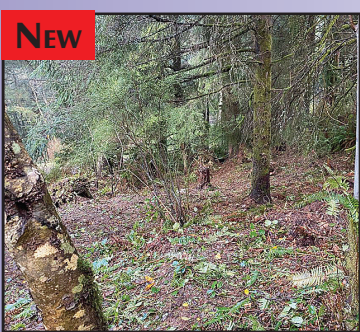
SHORE CREST DRIVE TL#7200 Don't pass up this great opportunity to build on this nice wooded lot with utilities at the street. This is a nice private setting just minutes to town and the beach and Sutton Lake is just around the corner. Affordably priced and ready to go! $49,995 #12122 MLS#20243616