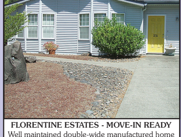
FLORENTINE ESTATES - MOVE-IN READY Well maintained double-wide manufactured home in 55+ gated community where you also own the land. Club house amenities include pool, sauna, library, meeting room, etc. Security patrols day & night in addition to gated entrances. Home has been professionally cleaned & ready for new owners! $315,000 #12038 MLS#20255094