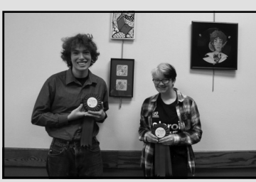
Support and Encourage Youth Artists