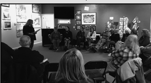
Poetry Open Mic