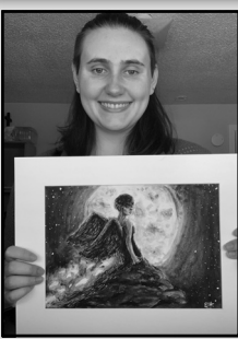
2020 Scholarship Award