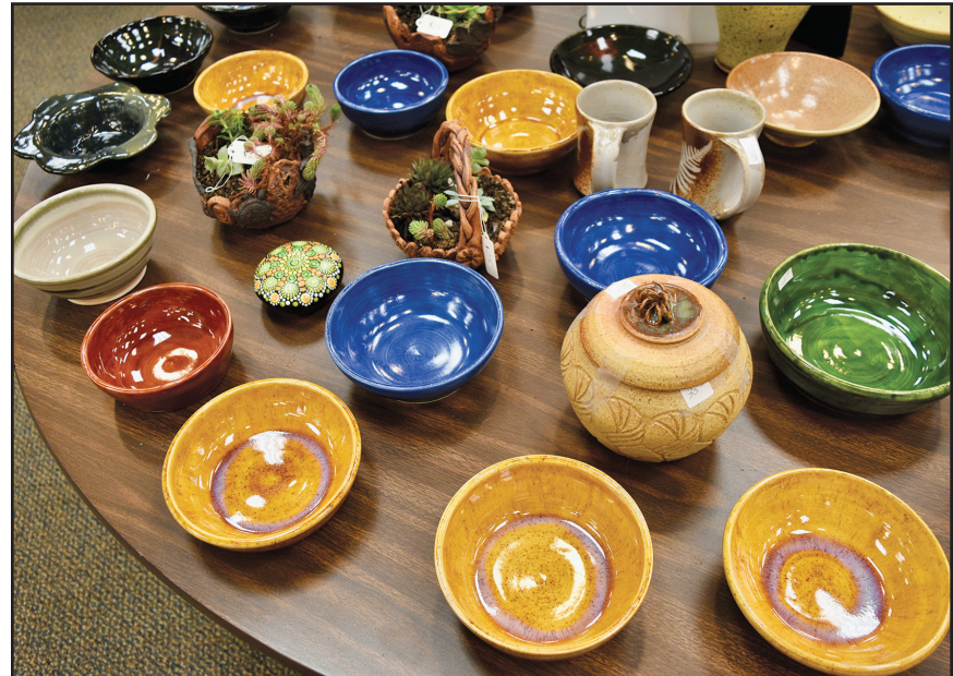
Empty Bowls brings together artists and restaurants in a long-standing fundraiser for Florence Food Share.