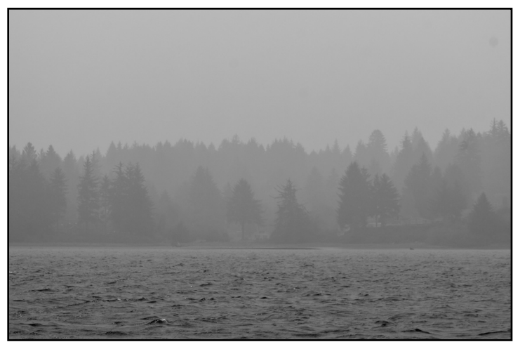
Smoke from fires in Eastern Oregon eclipsed the view of trees across Siuslaw River.

This allowed first responders to control the number of units responding to any one call while also making sure crews could cover the multiple calls happening in the district.