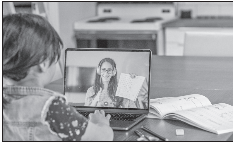
Everyone working from home, including students and teachers, should have designated areas for their home office space.

Home office capabilities became a big priority in 2020. Setting up your space should be part of your preparation for the start of the school year. — Metro