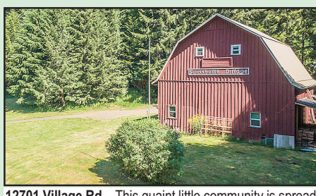
12701 Village Rd – This quaint little community is spread out over almost 20 acres in the hills near Swisshome. It boasts 18 homes and a huge red barn with upstairs used in the past for entertaining. Enjoy the community garden, outdoor chicken coop and playground. $1,275,000. #3093-20320301