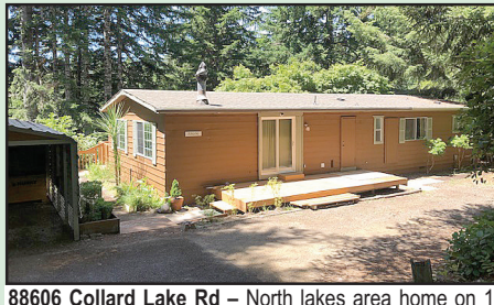
88606 Collard Lake Rd – North lakes area home on 1 acre with carport, large utility shed, greenhouse and room for RVs. Needs some TLC and completion inside. Beautiful back deck overlooking a terraced yard with raised garden beds and lush vegetation. Newer roof and carpet in 2018. $199,000. #3119-20536225