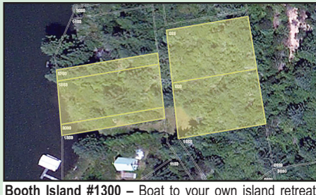
Booth Island #1300 – Boat to your own island retreat with 1.2 acres of pristine island living on Siltcoos Lake. Over 100' of lake frontage. Fish for Salmon, Steelhead, Trout and Bass. Kayak the Siltcoos River down to the Pacific Ocean. Nearby rentals are available at Westlake Resort. $90,000. #2729-17237076