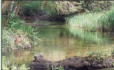
Chets Trail #2100 – Rare 5 acre secluded parcel in the woods. Septic approved, well in place, power to the lot. Fantastic lake frontage with two potential building sites and Woahink Creek running through the lot. Bring your home plans! $165,000. #2371-14010831