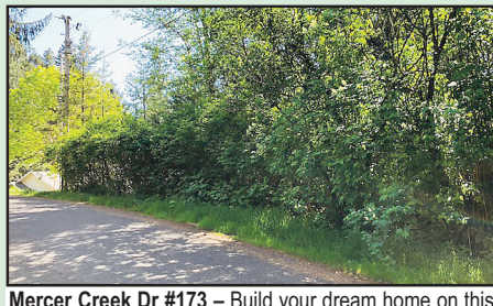
Mercer Creek Dr #173 – Build your dream home on this beautiful North Lakes area lot. Nestled in the trees and near Sutton Lake, this lot is .30 of an acre and ready for you to develop. Wind protected, quiet neighborhood, no HOA and close to all Florence has to offer. $53,000. #2830-18215029