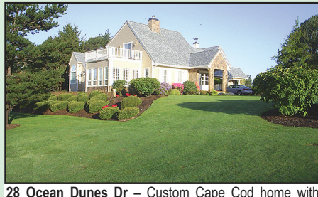
28 Ocean Dunes Dr – Custom Cape Cod home with views of the 18th green. Great room with pass-thru fireplace from kitchen to den. 2 master suites and guest room with full bath, home theater and rec room. Lot 27 is included and is the last buildable lot in Ocean Dunes. $1,050,000. #3124-20557608