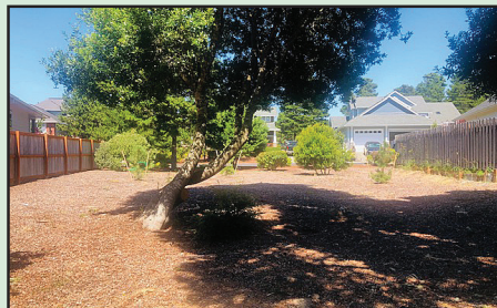
Royal St Georges Dr #6600 – Wonderful .15 acre lot available in Sandpines West. One of the few vacant lots left in this development. Cleared and build ready. City water and sewer available. Act fast this beautiful lot will not last! $77,700. #3123-20598902