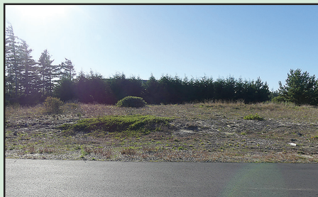
Dunewood Dr #76 – Cleared, level lot overlooking natural areas, with deeded lake and nature preserve access. Beautiful new development with curving streets, underground utilities, and Heceta Water. $85,000. #3045-19380152