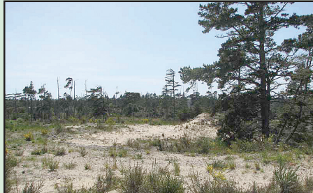
Dunewood Dr #77 – Cleared, level lot overlooks natural areas and wildlife, with deeded lake and nature preserve access. Underground utilities and Heceta water. $86,950. #3043-19163670