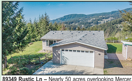
89349 Rustic Ln – Nearly 50 acres overlooking Mercer, Sutton and the ocean. This property has ample Mercer Lake frontage with a 1680sqft home and brand-new dock. Enjoy the views from inside and out. TL200 provides 1/7 ownership interest with lake access and common area. $875,000. #3084-20233920