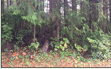
Cedar St #800 – Nice corner lot south of Florence near dunes, beach and town. Paved roads to this wooded lot with lots of possibilities. Quiet neighborhood with nice, newer homes around. Needs cleared and developed, so bring your ideas. Priced to sell! $29,900. #2785-17017018