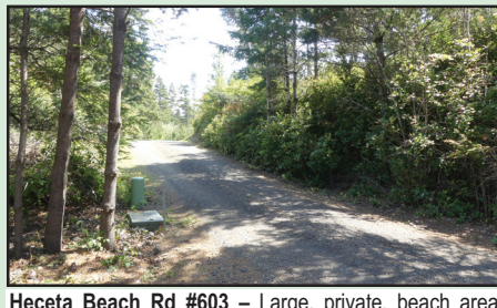
Heceta Beach Rd #603 – Large, private, beach area wooded lot. This elevated cul-de-sac location is only minutes from the beach and town. Power and Heceta water available, septic approval, located in Heceta Lake Estates. Manufactured homes OK. $94,500. #2834-18411160