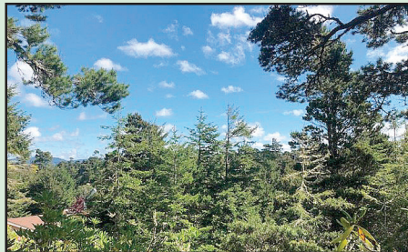
91 Windleaf Way – This is a great opportunity to build your home close to the beach, in a great community of very nice homes. The seller is willing to carry so bring us an offer and start planning your future in Florence. $68,000. #2797-18615048