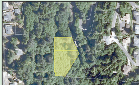
Maple Lane #6 – Buildable, private lot in Rhodo View Dunes Estates. Build your custom home in this gated subdivision with all city services. Possible seller terms. $19,995. #2210-13084475