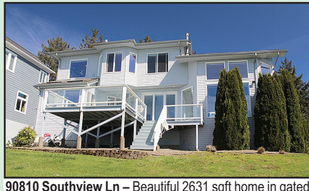
90810 Southview Ln – Beautiful 2631 sqft home in gated Southview with panoramic ocean views. This 3 bdrm, 2.5 bath home has high ceilings, master suite with walk-in closet, double-sided propane fireplace and jetted tub, and large deck for entertaining. 4-car garage with 12' RV door, 30 amp and dump. $775,000. #3127-20033143