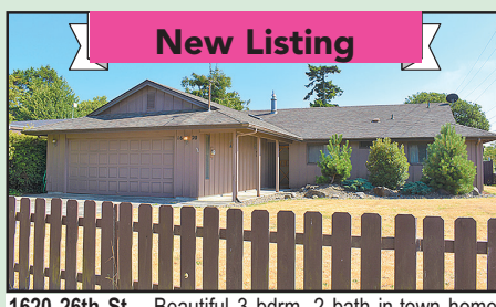
1620 26th St – Beautiful 3 bdrm, 2 bath in-town home across the street from the Middle School. This home has tons of built-in storage and attached garage. Corner lot with extra RV/boat storage with access off of Oak St. Enclosed patio offers hot tub hookups and privacy. $345,000. #3114-20363440