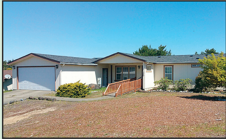
1240 Xylo St – Central location in town, large fenced backyard, low maintenance landscaping. Roomy interior with separate family room area, and large kitchen and dining. Home will need some TLC, but there's lots to like here. $245,000. #3066-20148310