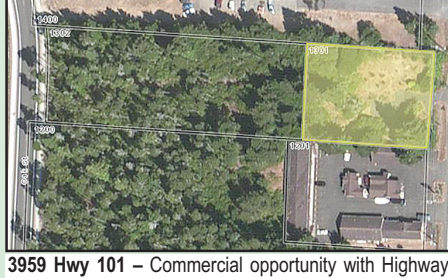
3959 Hwy 101 – Commercial opportunity with Highway 101 frontage located in the North Florence commercial district. Highway District zoning allows for many different uses. The adjacent 1.22 acre lot to the west has frontage on Oak Street and is also for sale. $249,000. #2703-17034510