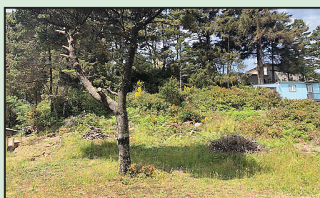
4th Avenue #106 – Nice beach area lot with water and power services at the lot line. With a little clearing this lot could be ready for your new home. Walking distance to the beach and minutes to town. Bring your toys and enjoy your little gem on the coast! $55,000. #2995-19651615