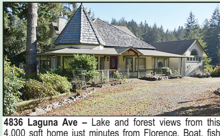
4836 Laguna Ave – Lake and forest views from this 4,000 sqft home just minutes from Florence. Boat, fish and kayak from your private dock. Remodeled in 2003. This house has hardwood floors, gourmet kitchen, and large master suite with walk-in closet. Pole barn and large 3 bay RV barn provide plenty of parking. $1,369,000. #2850-18330278