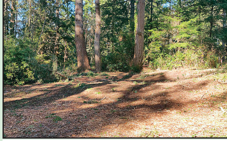
89440 Shore Crest Dr – Two lots are being sold together, lots 300 and 400. One has an old septic system and cement runners, the other has a water meter. Both semi-cleared. Nice opportunity to build as desired, either stick-built or manufactured. $72,000. #3091-20296146