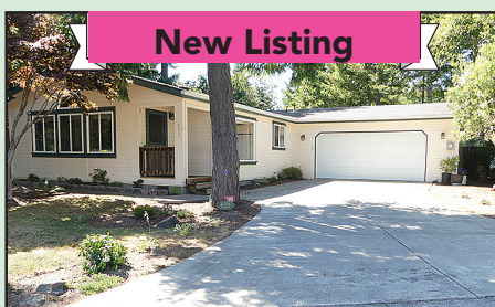
853 Munsel Creek Ln – Spacious 1637 sqft Golden West home with 2 bdms, 2 baths plus an office. An attached double-car garage. Fresh paint throughout. All appliances come with the house. Backyard is fenced and recently landscaped. $287,000. #3131-20595817