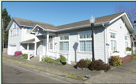
1361 1st St – Rare commercial/residential property just a block from Bay Street! This beautiful, custom-built gem is a gorgeous place to work and call home. Live in the heart of Old Town Florence. Walk to your favorite coffee shop, restaurants and boardwalk. $590,000. #3085-20045610