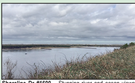
Shoreline Dr #1600 – Stunning river and ocean views from this cul-de-sac lot in gated Shelter Cove. Build your dream home with underground utilities, city water and sewer available. Level and cleared with end-of-road privacy. An engineer's report is on file as well as a home plan. $179,000. #2664-16013673