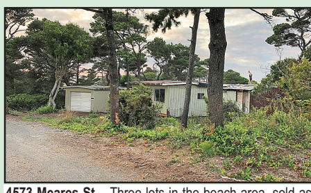
4573 Meares St – Three lots in the beach area, sold as one, with potential ocean views from your new 2-story dream home! Trail to the beach is less than a 1/4 mile away. This is a fixer or tear-down. Small detached garage. City water; septic in unknown condition. Surveyed recently. Use caution, broken glass. $230,000. #3031-19516633