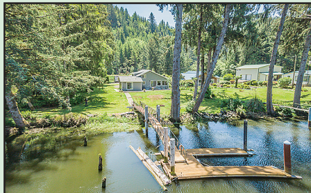
8399 Duncan Island Rd – Stunning home with 2 bdms plus loft, and 2.5 baths on Duncan Island. Cast your line off your private dock. This home has 1.77 acres with beautiful landscaping and river frontage, as well as access to the south slough. $435,000. #3101-20292428