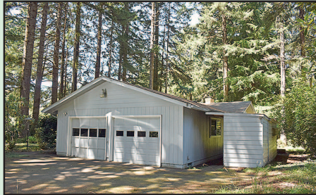
5665 Maple Dr – Great family home with 3 bdms, 2 baths, and both living and family rooms. Nestled between Woahink and Siltcoos Lakes, the 2-car garage and large lot provides plenty of parking and storage for your RV or sandy toys. $369,000. #3117-20675534