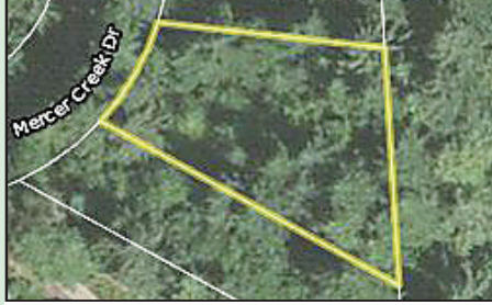
Mercer Creek Dr #00148 – Nice, wooded .32 acre lot near Sutton Lake in an area of fine homes. This wonderful North Lakes area lot is waiting to be developed and built on. Property has mature trees and native vegetation. Water and power available. $64,900. #2597-16420336