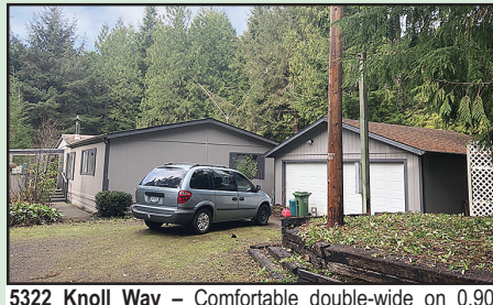
5322 Knoll Way – Comfortable double-wide on 0.90 acre! Vaulted ceilings, front and back covered decks. Two guest bdms on the opposite end of the home from the master. Some deferred maintenance. A vacant lot is included. Driveway entrance is gated, room for RV and boat. $299,500. #3055-19307442