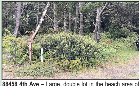
88458 4th Ave – Large, double lot in the beach area of Florence. Vacant Land except for a garage built with permit. Heceta water and power available. Septic Approval from Lane County. A great location to live and vacation with the ocean just a hop, skip, and-a-jump away. $115,000. #3094-20581382