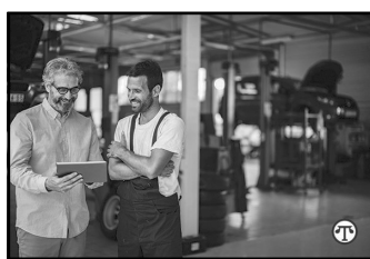
Wherever business happens, a robust internet connection is essential—and now, with satellite systems, it's possible.

(NAPSI)—Modern satellite Internet means small and medium businesses can get a connection no matter where they are. Satellite is driving innovation across industries as diverse as construction, nonprofits, agriculture, retail and more in even many of what may seem to be the hardest-to-reach places.