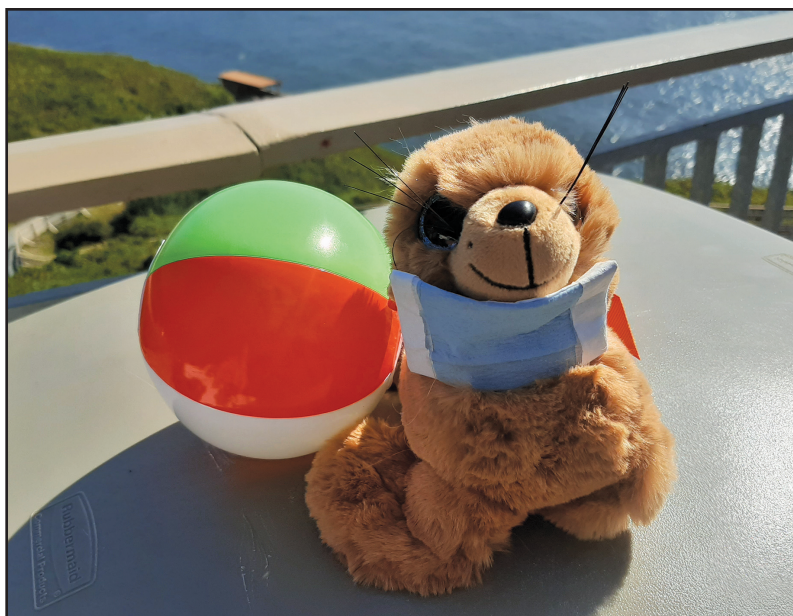
Sami the Sea Lion is again on display at local businesses — this time wearing a mask but still ready to be spotted by the community.

Based on last winter's successful Sea Lion on A Shelf trail, shoppers can venture to any of nearly 30 participating Chamber member's businesses and get their passports stamped when they spot Sami. A minimum of 15 stamps are necessary to enter for a chance to win valuable prizes.