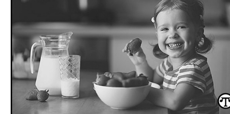
There are many ways to get any help you need to be sure you have enough nutritious food.

At the very least, large grocery stores offer a much wider variety of fresh produce, whole grains and other healthy foods that are often available in small neighborhood stores. Many low-income communities lack such grocery stores, and people without their own transportation may have difficulty accessing healthy food sources. Medicaid enrollees who are eligible for home and community-based services (HCBS) can get