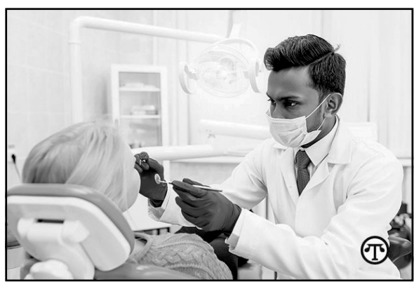
Regular dental visits are an essential part of your overall health. With proper precautions on your part and that of your dentists, they can be safe and effective.