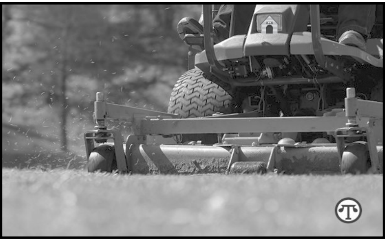
With the right equipment, taking care of your yard can be almost as delightful as relaxing in it.

1.Plan your yard needs. Draw a sketch and include such major features as trees, bushes, a garden, flower beds, lawn furniture, play or sports equipment, or a patio. Note where maintenance is required. Will bushes need to be trimmed back? Do you want to install more flowering bushes or trees? Are you planning to add a fence and more grass