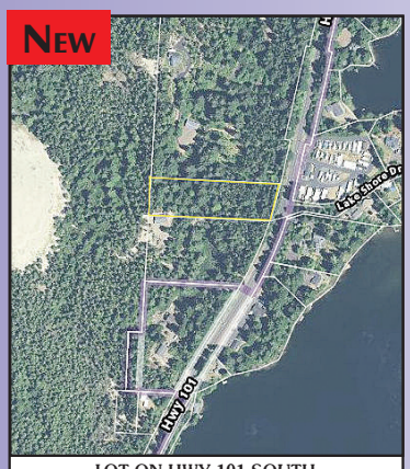
LOT ON HWY 101 SOUTH

It's all here! Nicely remodeled 1700 SF home; awesome upgrades including $20K heat & a/c system, concrete counters & heated tile floors. Detached garage w/ finished 416 SF guest room above; Huge 40x45 shop w/ pass-through doors; and an extra building lot. Plenty of room for all your toys & vehicles. Easy access off Highway 101 yet wooded and private. $450,000 #12023 MLS#20492164