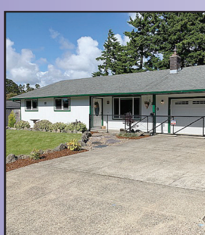
1230 KINGWOOD STREET

1.85 acre lot in the beautiful Doonbrae area off Clear Lake Road. Underground utilities, water, and septic approved. Site built homes only. at this beautiful home site. $125,000 #12014 MLS#20639466