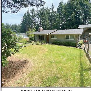
5222 HILLTOP DRIVE

Top floor oceanfront condo at Driftwood Shores. This is a 3 bedroom, 2 bath unit that has recently been upgraded with granite counters, wall to wall carpeting & laminate floors. This unit is also next to the stairs and elevator for easy access. Shown by appointment only. Please wear masks & gloves. $299,000 #12011 MLS#20670896