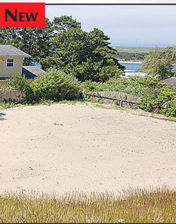
N RHODODENDRON DR

New Construction Alsea X Model 1603 sq. ft. to be completed by mid-July 2020. Open style living room, dining room & kitchen. 3 BD. 2 BA eaturing high 9 foot ceilings throughout and 11 foot ceilings in the living room, quartz countertops stainless steel appliances, and custom soft-close alder cabinets, including bathrooms. Master bath has double sinks, tile floor & custom tile roll-in shower. Ductless heat pump for heating & cooling. $359,629 #12018 MLS#20220318