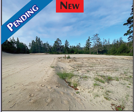
83085 HWY 101

ean & beach view w/access steps a porch! This Upscale gated community has beach access points for residents separate from public use. This home is very close to an access point. A must-see in person. Bring your coffee onto the back porch & take a walk on the beach. Come check out the vaulted ceilings, cozy pellet stove, open floor plan, master jacuzzi tub, ocean views from bedrooms, solid wood doors, plenty of storage, roomy kitchen, green belt privacy. $539,000 #12020 MLS#20068523