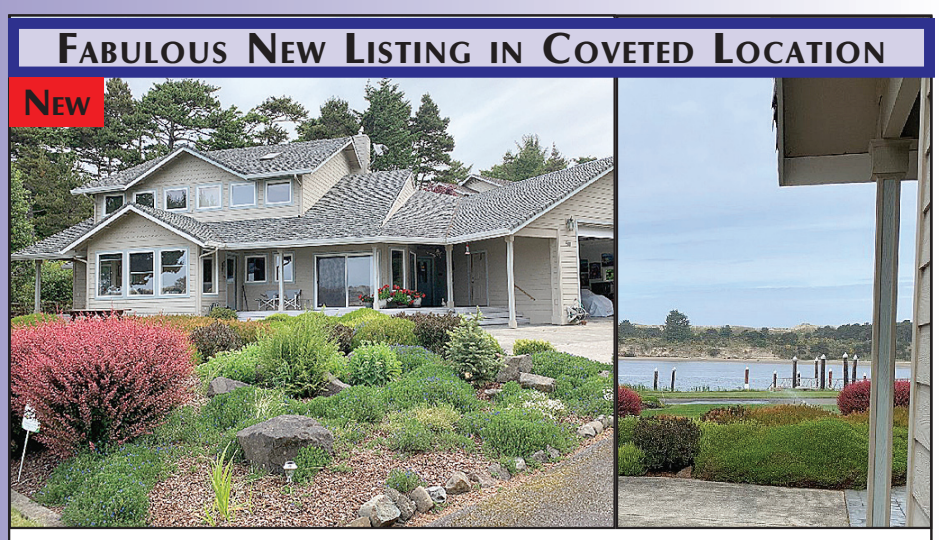
911 RHODODENDRON DRIVE

FEATURED NEW LISTINGS, PRICE REDUCTIONS & UPDATES FOR THE WEEK OF JULY 8, 2020