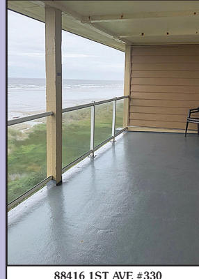
88416 1ST AVE #330

YOU ARE GOING TO LOVE THIS HOME! The moment you drive up you will instantly appreciate the incredible "professional" landscaping. This 3 bed, 2 bath home is extremely well cared for and provides easy single-level living. The beautifully private and terraced backyard is fully irrigated, detailed with a "stamped" concrete patio and is fully fenced. This home is priced to sell and an excellent value. $304,500 #12013 MLS#20142918