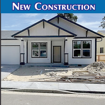
BRAND NEW CONSTRUCTION

wooded, untouched 3-acre parcel directly adjacent to the US Department of Agriculture property (Dunes Recreational Area). Approx 165' of Hwy 101 frontage. Potential Woahink lake and ocean views from the upper ortion of the property. Same family ownership r decades...Now time to liquidate. $79,000 #12024 MLS#20080505