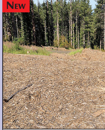
1.85 ACRE HOMESITE

These B units are the most desirable floor plans at Driftwood Shores. Own this 2 bdrm unit as your own vacation destination at the beautiful Central Oregon Coast and earn income when you're not here. This unit is in the rental pool. Features include a full kitchen, 3 queen beds, 2 bathrooms & 2 oceanfront covered decks. Unit(s) 217 & 219 are adjoining rooms on the second floor. Close to the pool and children play area. $183,500 #12015