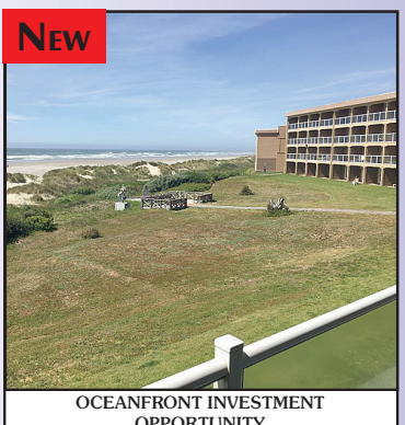
OCEANFRONT INVESTMENT OPPORTUNITY

Build your home on this large cleared ready-to-go lot close to everything you want and need. Minutes to beach access + Old Town. All city services are available at the lot line. Good potential for river and distant ocean views. No HOA's or CC&R's. $72,500 #12016/MLS#20485488