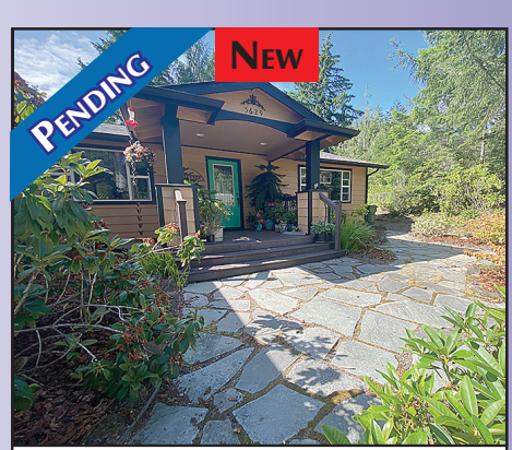
5629 OTTER WAY

quality-built manufactured 1911 SF home located in 55+ premier community of Florentine Estates, Kitchen & forma dining w/ lots of morning light. Large gourmet kitchen w/ solid oak cabinets, Corian counters; lots of counter & cabinet space; counter depth. Wood burning fireplace in living rm; grand master suite with bidet-like feature. Origami coffered ceilings. Enjoy your own 'English Tea' garden in this park-like setting w/excellent ndscaping. $355.000 #12021 MLS#20460205