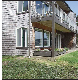
1080 BAY STREET #18

updated immaculate yard & park-like setting. nice green house & 23x32 shop. Open concept floor plan with a new $4900 pellet stove & engineered hardwood floors. Kitchen has beautiful custom cabinetry & skylights. French doors to the large, wind protected deck. Large master suite with slider to private deck and hot tub. Master Bath has heated tile floors, double vanity and walk in shower Desirable South Lake neighborhood A great value for this beautiful home $434,900 #12007 MLS#20386855