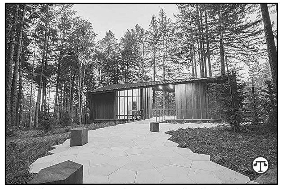
A beautiful forest can be a final resting place that brings comfort to family and friends

(NAPSI)—The vast majority of Americans have not completed their end-of-life planning. In fact, over half of those age 45plus have done no end-of-life planning at all, according to a recent survey conducted by Better Place Forests, the country's first sustainable alternative to cemeteries for families that choose cremation.