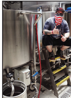
Brewery honors First Responders INSIDE — B

RECORDS Obituaries & response logs Inside — A2