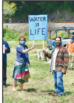
People protest spraying INSIDE — A3