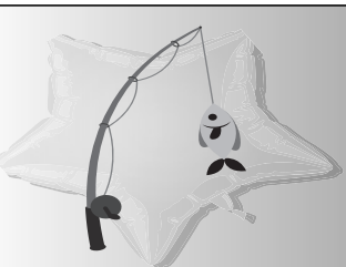
National Go Fishing Day June 18, 2020