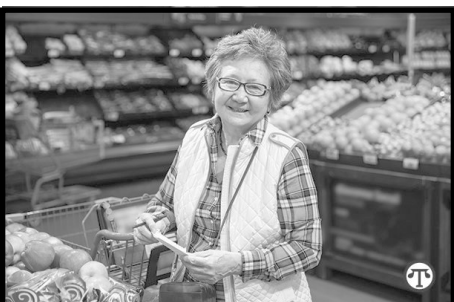
Older shoppers can save big on groceries with a new program that lowers costs and identifies healthful options right in the store.

Shoppers Save Big On Groceries With Healthy Savings® Powered By AARP Foundation New Program Lowers Costs, Identifies Healthy Options in the Store