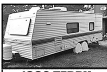
1992 TERRY FLEETWOOD 26'

4-Dr., auto, 96K mi., good cond. 1-owner, garaged. $2,500 541-991-1708