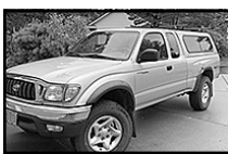
2003 TOYOTA TACOMA SR5

Brand New in box FS126 Inflatable SUP, Swivel Seat. $850 541-707-0532