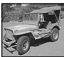
1944 WILLYS JEEP