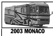
2003 MONACO WINDSOR

190 Popular, 14,555 mi., AC/heat pump, fully contained, upgrades, like new. $50,000 541-997-5393