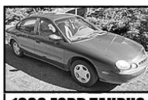
1996 FORD TAURUS

As stable as a barge, as fast as the new boats at a fraction of the cost. Motor and a perfect fit trailer. $1,200. 541-991-6677