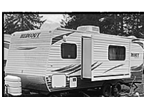
2010 KEYSTONE HIDEOUT 21'

Very good shape. $9,900 obo. Located in Florence, OR. Call or text 559-994-6294