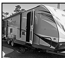
2019 BULLET 27 NEW

HARLEY DAVIDSON 1971 & 1972 Harley-Davidson Sprints (350's) plus an extra motor. $2,500 for all. Call 541-999-0541