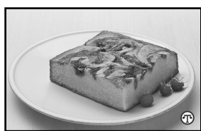
Swap plant-based foods in with your favorite summer treats for a new, healthy twist!

(NAPSI)—From blueberry pies with flaky buttery crusts to grilled buttered corn on the cob, summer is filled with delicious foods that bring people together. Now summertime eating is getting a makeover by swapping that pat, dab or dollop of regular dairy butter with dairy-free Plant Butter.