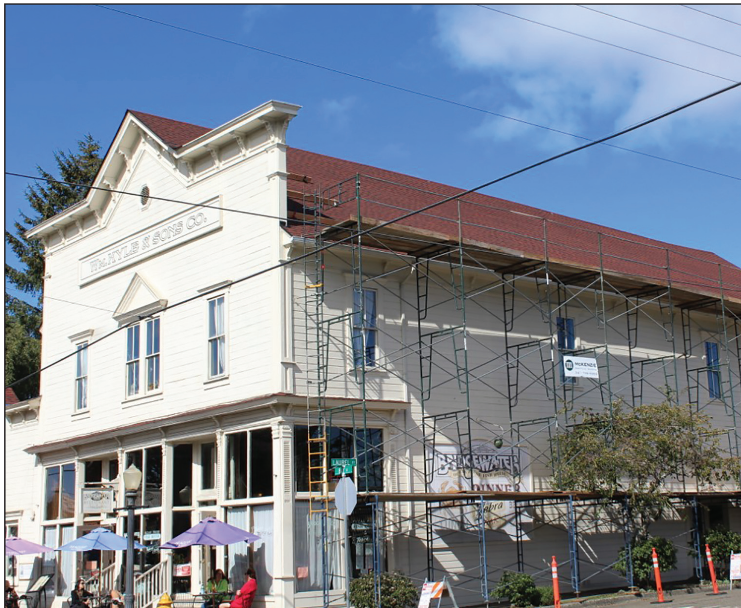
The Kyle Building in the final stages of repair (above); The sign for the Bridgewater Restaurant (bottom left) which is located in the lower level of the building; A special sign (below right) commemorates the project.