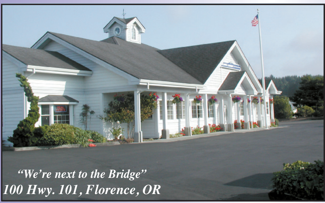
"We're next to the Bridge" 100 Hwy. 101, Florence, OR