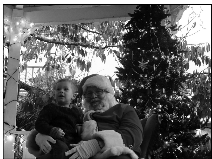
Florence Area Chamber of Commerce is getting ready for the holidays in Old Town and everywhere in Florence.

For the 2019 holiday season, the Florence chamber purchased a commercial-grade tree, new ornaments and LED lights that will last through this