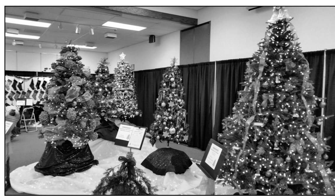
Oregon Coast Military Museum's Florence Festival of Trees returns Nov. 30 and Dec. 1 at the Florence Events Center. Saturday's events are free to the public. Tickets are available now for Sunday.

Performances by the Florence Community Chorus, Holiday Bell Ringers, CROW Flight Dance Team and vocal performers, as well as a children's choir