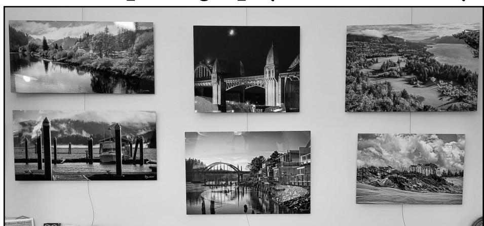
The Florence Visitor's Center, 290 Highway 101, will display Rodger Bennett's photography throughout November and December.

"There are a couple of familiar local scenes on display