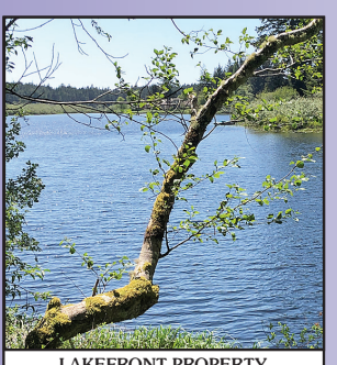
LAKEFRONT PROPERTY 2+ ACRES OF PRIVATE, LAKEFRONT PROPERTY on both sides of Sutton Lake Road. Build with a view of Sutton Lake then walk to your lakefront area across the road. Utilities at street, septic approved. $175,000 #11833 MLS#19428976