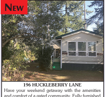
NEW 196 HUCKLEBERRY LANE Have your weekend getaway with the amenities and privacy of a gated community. Fully furnished park model with bedroom and storage shed additions. Tucked into the lot leaving plenty of room to create your outdoor living. Space fully covered patio. Conveniently located one block from clubhouse laundry, pool, and mail. $115,000 #11919 MLS#19219463