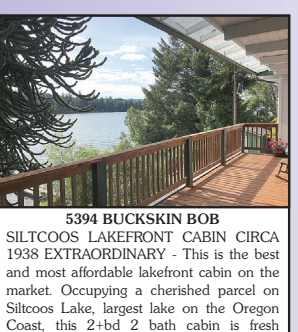
5394 BUCKSKIN BOB SILTCOOS LAKEFRONT CABIN CIRCA 1938 EXTRAORDINARY - This is the best and most affordable lakefront cabin on the market. Occupying a cherished parcel on Siltcoos Lake, largest lake on the Oregon Coast, this 2+bd 2 bath cabin is fresh throughout with oak floors, cedar, new water treatment system, lower level bonus room with extra bath, acid washed concrete floors, lake's edge boathouse and a huge magnolia and monkey puzzle tree. Hurry on this one with time to enjoy beautiful Siltcoos Lake this summer and fall. $344,000 #11822 MLS#19043807