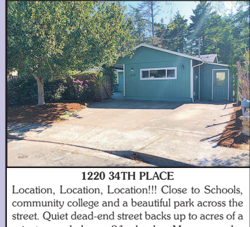
1220 34TH PLACE Location, Location, Location!!! Close to Schools, community college and a beautiful park across the street. Quiet dead-end street backs up to acres of a private wooded area. 3/bed + den. Many upgrades throughout, including paint. Hardwood floors, newer roof and significant updating in recent years. Private courtyard/English tea garden with water feature. Oversized parking area. Great buy @ $145 SF. Set up your showing today! $268,500 #11889 MLS#19561357