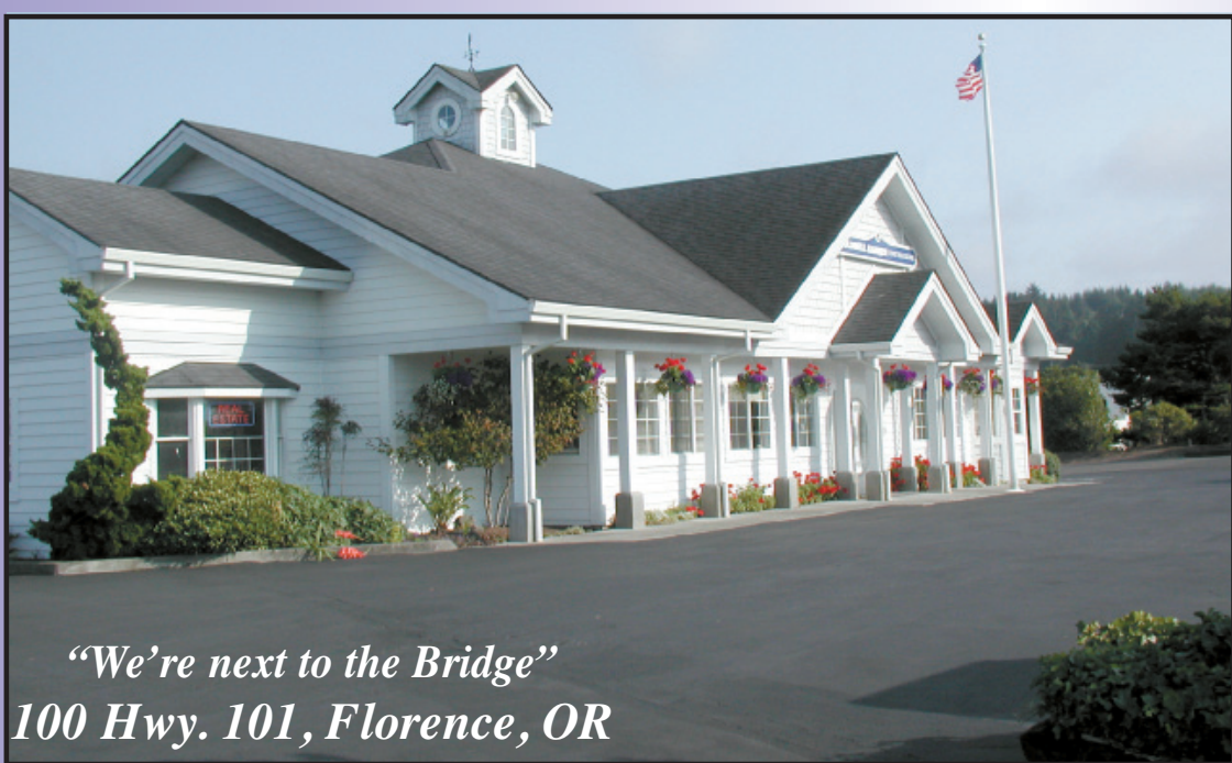
"We're next to the Bridge" 100 Hwy. 101, Florence, OR