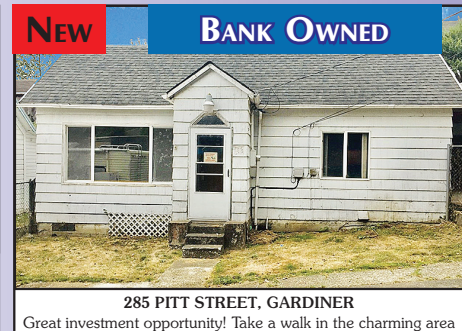
NEW BANK OWNED 285 PITT STREET, GARDINER Great investment opportunity! Take a walk in the charming area with views of the bay from the street. It is only a 20-minute drive from Florence and a 4-minute drive to Reedsport. BofA employees, spouse or domestic partner, household members, biz partners, and insiders are prohibited from purchasing. Subject to 5% buyer's premium. Map and drive time provided by google maps. Call for more information on the bidding process. $102,900 #11918 MLS#19089195