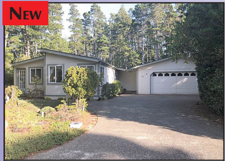
NEW 180 FLORENTINE AVE Very well maintained 1991 Silvercrest manufactured home with 2 bedrooms and 2 baths and a large den located on a .25-acre site. It has a very large 24x32 oversized 2-car garage. It has nice landscaping and a large rear patio. The home is conveniently located close to the clubhouse. $274,900 #11917 MLS#19699085