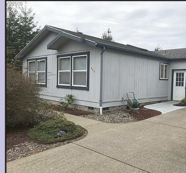
438 SHERWOOD LOOP 1782 square foot, 3 bedroom, 2 bath Florentine residence. Great floor plan with open kitchen, large master, private rear covered deck. Rear garage with covered breezeway. Priced to sell. Awesome opportunity! $264,900 #11912 MLS#19321755