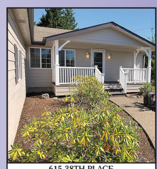
615 38TH PLACE Beautiful private home on "a hill" in Florentine estates home to park boat or RV. Newly painted exterior. Two living spaces, and a formal dining room. The roof is 1999. Come see this awesome gated community if you are 55 or older! $342,000 #11705 MLS#18525370