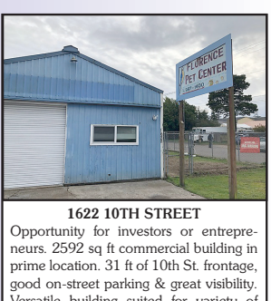
1622 10TH STREET Opportunity for investors or entrepreneurs. 2592 sq ft commercial building in prime location. 31 ft of 10th St. frontage, good on-street parking & great visibility. Versatile building suited for variety of uses. 2 suites both w/ offices & a common bathroom. Use as it is & go or purchase & use one side and lease out the other. Lots of possibilities. Seller will sell the inventory & real estate separately. See Listing agents for details. $238,500 #11782 MLS#19278212