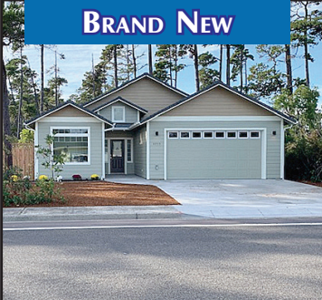
BRAND NEW 3755 OAK STREET Brand new home, in town on large .22 wooded acre lot. Close to shopping and golf course. Granite counters, ductless heat pump, includes black stainless kitchen appliances. $369,000 #11900 MLS#19396992