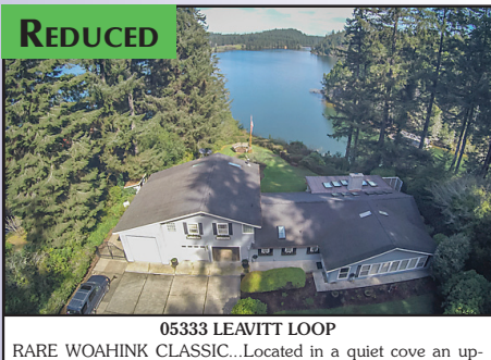
REDUCED 05333 LEAVITT LOOP RARE WOAHINK CLASSIC...Located in a quiet cove an updated mid-century modern defines lakefront luxury living! Pride of ownership inside & out! Lush park like setting! Priceless views of Woahink Lake! Dock/boathouse access to the lake. Tasteful interior w/ inviting kitchen, formal dining room & spacious living room. Elegant master suite w/ bath & reading room lower and upper-level windowed porches offer beautiful lake views. $799,000 #11829 MLS#19019818