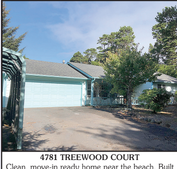
4781 TREWOOD COURT Clean, move-in ready home near the beach. Built in 1992 with two living areas, one with a propane woodstove. 2 bedroom suites & a wonderful sunroom to enjoy nature. Completely fenced rear yard with 2 nice sheds. 3 car garage & metal carport. Wooded private corner lot close to the beach. $300,000 #11914 MLS#19578100