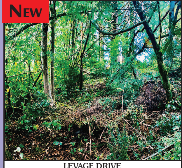
NEW LEVERAGE DRIVE Come see the opportunities to be steps away from Sutton Lake yet close to town. This lot is raw land with lush green and wooded views. Filtered lake views may be possible with clearing at the top. Come build your dream home or enjoy your own forest. $39,000 #11916 MLS#19475920