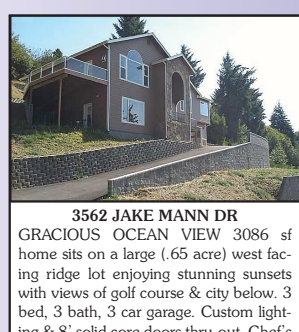
3562 JAKE MANN DR GRACIOUS OCEAN VIEW 3086 sf home sits on a large (.65 acre) west facing ridge lot enjoying stunning sunsets with views of golf course & city below. 3 bed, 3 bath, 3 car garage. Custom light's & 8' solid core doors thru-out. Chef's kitchen w/Jenn-air appliances, 2 ovens & under cabinet lighting. Large master suite w/whirlpool tub with views of ocean & dunes! Grow grapes in your terraced garden. In-town home in upscale gated community. $499,900 #11513 MLS#17084975