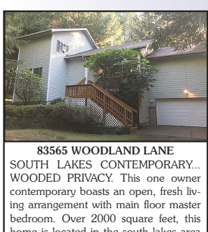
83565 WOODLAND LANE SOUTH LAKES CONTEMPORARY... WOODED PRIVACY. This one owner contemporary boasts an open, fresh living arrangement with main floor master bedroom. Over 2000 square feet, this home is located in the south lakes area close to Woahink Lake with a great surrounding forested setting offering privacy & tranquility. Rear deck with awning, firepit & hot tub provides wonderful outside living. Needs a little TLC. Hurry on this one! $459,900 #11750 MLS#18143696