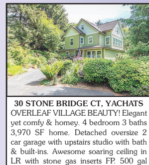
30 STONE BRIDGE CT, YACHATS OVERLEAF VILLAGE BEAUTY! Elegant yet comfy & homey. 4 bedroom 3 baths 3,970 SF home. Detached oversized 2 car garage with upstairs studio with bath & built-ins. Awesome soaring ceiling in LR with stone gas inserts FP. 500 gal underground propane tank ensures your cozy fire year round. Light, bright kitchen with conveniently located pantry/laundry room. Custom library with floor to ceiling bookcases & SO MUCH MORE. OUTSTANDING VALUE! $549,500 #11850 MLS#19200658