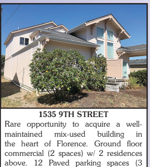
1535 9TH STREET Rare opportunity to acquire a well-maintained mix-used building in the heart of Florence. Ground floor commercial (2 spaces) w/ 2 residences above. 12 paved parking spaces (3 covered), same owner since new, and pride of ownership shows. Great opportunity to expand your investment portfolio or acquire that "live-work" set-up you've always dreamed about. $392,500 #11893 MLS#19462600 & MLS#19305102