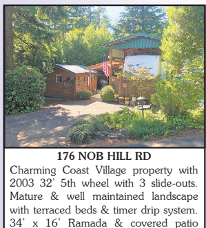
176 NOB HILL RD Charming Coast Village property with 2003 32' 5th wheel with 3 slide-outs. Mature & well maintained landscape with terraced beds & timer drip system. 34' x 16' Ramada & covered patio make for a relaxing outdoor living space. Plenty of parking & additional RV hook-up capability. 10' x 12' shed ties in well to property & features electricity, shelving & additional refrigerator. Look no further for your getaway at the coast! $122,000 #11888 MLS#19520822