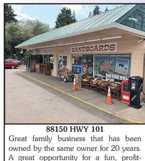
88150 HWY 101 Great family business that has been owned by the same owner for 20 years. A great opportunity for a fun, profitable, turn key business. Great building with lots of upgrades, roof, awning, ductless heat pump, CCTV, some fridge cases. Separate wood business can be purchased with store. (See LA for information) $450,000 #11865 MLS#19563227