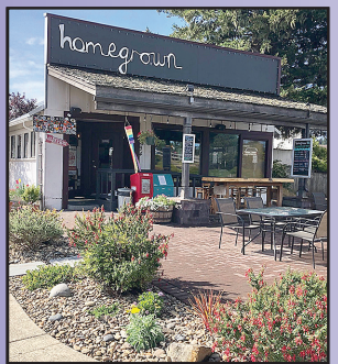
294 LAUREL STREET Unique Old Town property. Land + building for sale. 0.26 acres commercial. Restaurant lease, 2 apartments + woodshop area gross rent approx $3350 a month. Set up an appointment to view. $475,000 #11891 MLS#19429547