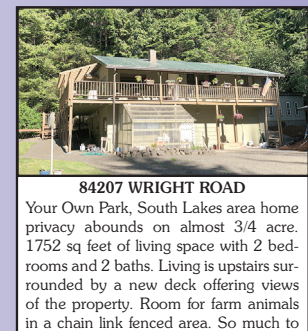
84207 WRIGHT ROAD Your Own Park, South Lakes area home privacy abounds on almost 3/4 acre. 1752 sq feet of living space with 2 bedrooms and 2 baths. Living is upstairs surrounded by a new deck offering views of the property. Room for farm animals in a chain link fenced area. So much to see you must schedule a showing to appreciate. Newer roof, deck, and interior & exterior paint. Outside amenities not limited to a 32' ramada, 2 entrances, hot tub, shop inside 3 bay garage. And so much more. $350,000 #11849 MLS#19191451