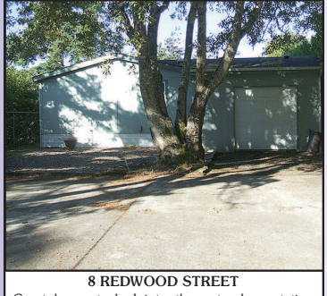
8 REDWOOD STREET Great home tucked into the natural vegetation and privacy of a gated park. Lots of living area w/ added cozy den w/ pellet stove, deck, fenced backyard. New flooring in the dining area, kitchen and laundry. Single attached garage w/ workbench and small pantry area. $185,000 #11907 MLS#19176480