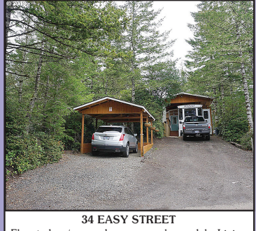
34 EASY STREET Elevated w/ ramada over park model. Living room addition w/ vaulted ceilings + french doors. Multiple decks fenced yard w/ 2 storage sheds + spa. Bunkhouse remodeled in 2016 w/ newer floors vaulted ceilings, new doors, windows + washer/dryer. Shown by appt only. $160,000 #11911 MLS#19136663