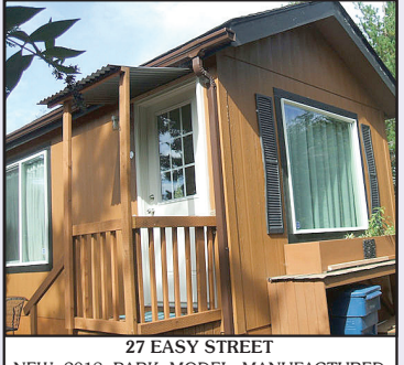
27 EASY STREET NEW 2018 PARK MODEL MANUFACTURED HOME. Seller has relocated. Lots of amenities here: BBQ covered area on deck, bunkhouse/storage shed, RV hook-up & room for small RV in front. Landscaped yard, lots of plants. Buyer to pay $25.00 Coast Village Transfer Fee. $145,000 #11904 MLS#19387986