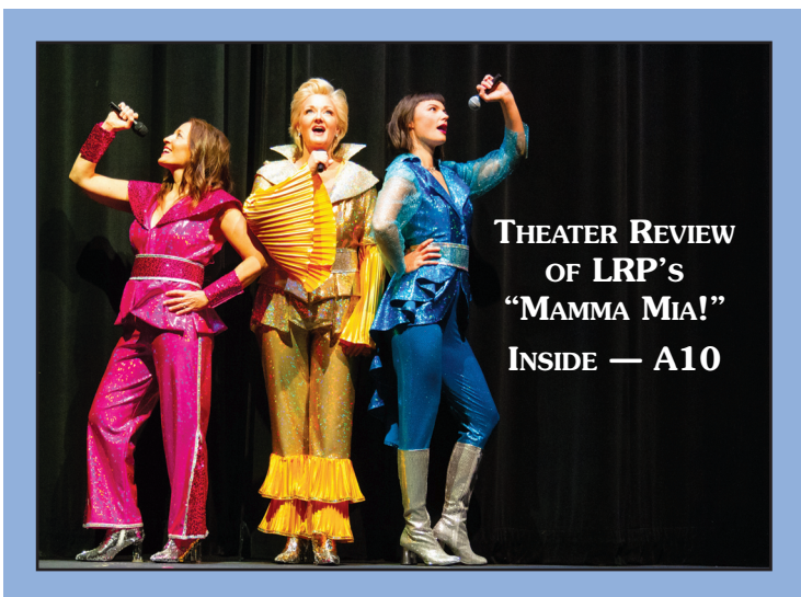
THEATER REVIEW OF LRP'S "MAMMA MIA!" INSIDE — A10