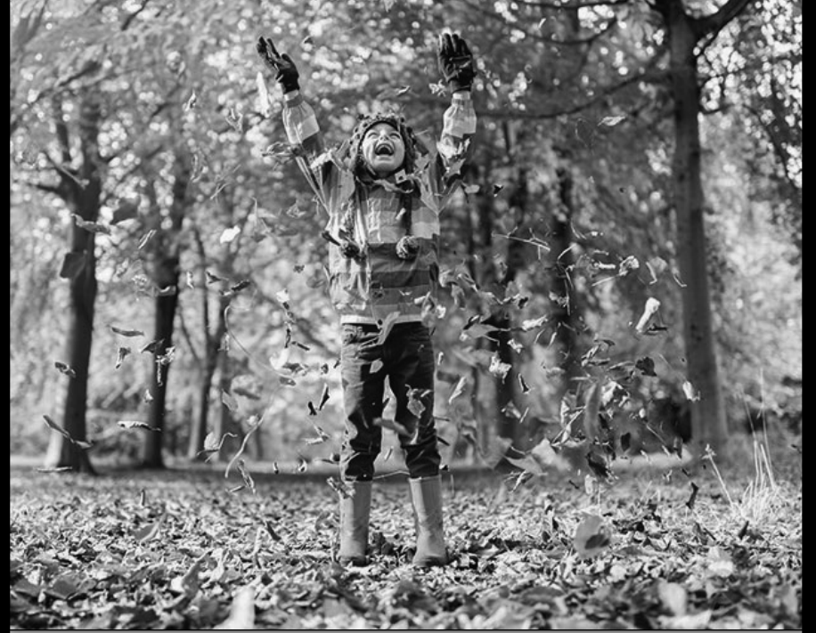
To the world, you may be one person – but to a child you may be the world.