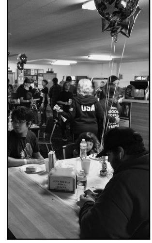
Dozens of families participated in last weekend's PCC Family Fun Day at Holiday Bowl.