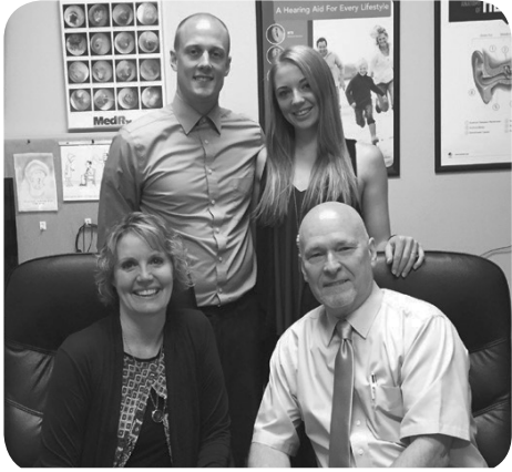
Best for Hearing Staff

Best For Hearing is a family-owned business with a 39-year history in providing hearing help to those with hearing loss. We are committed to the total hearing health needs of our patients and their families and recognize that hearing impairments effect not just individuals, but the entire families. We are here to help families hear better!