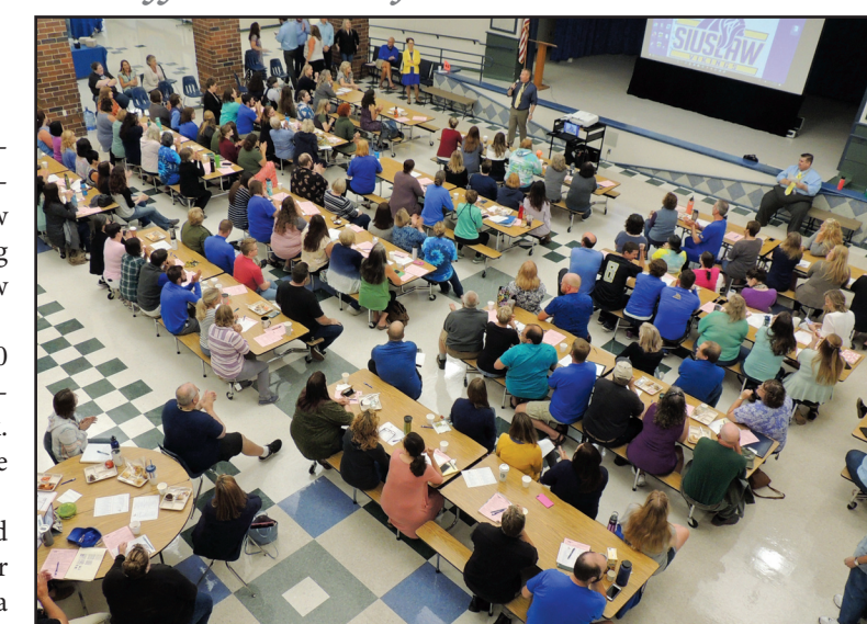
Siuslaw School District gathered for an all-staff meeting and breakfast Thursday as a chance to welcome new staff, celebrate years of service and introduce goals for 2019-20.

open positions. "If you know someone who is interested in the budget, send