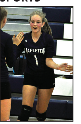
Sports start in Mapleton, Siuslaw INSIDE — SPORTS