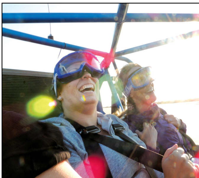
A view from one of the smaller, 6-person dune buggies (top) offers riders an up-close-and-personal experience of the Oregon dunes.

Both Sandland Adventures, 85366 Highway 101 near South Jetty Road, and Sand