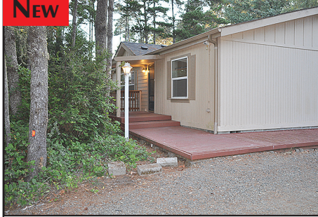
NEW 4793 SEAPINE DRIVE Rare opportunity! Wooded beach area 1999 Silvercrest w/ detached studio apartment - permits on file. Perfect set-up for extended family, guests, or in-laws quarters. Main home is 1485 SF. Apartment is 741 SF, leaving 195 sq. ft. of storage w/ garage door. Currently rented at $1500/mo; shown by appt. only. $279,000 #11887 MLS#19671519