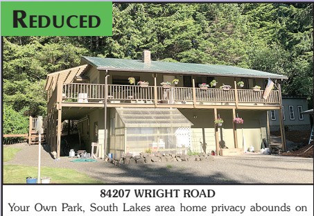
REDUCED 84207 WRIGHT ROAD Your Own Park, South Lakes area home privacy abounds on almost 3/4 acre. 1752 sq feet of living space with 2 bedrooms and 2 baths. Living is upstairs surrounded by a new deck offering views of the property. Room for farm animals in a chain link fenced area. So much to see you must schedule a showing to appreciate. Newer roof, deck, and interior & exterior paint. Outside amenities not limited to a 32' ramada, 2 entrances, hot tub, shop inside 3 bay garage. And so much more. $350,000 #11849 MLS#19191451