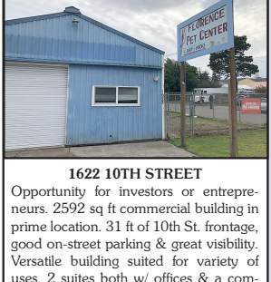
1622 10TH STREET Opportunity for investors or entrepreneurs. 2592 sq ft commercial building in prime location. 31 ft of 10th St. frontage, good on-street parking & great visibility. Versatile building suited for variety of uses. 2 suites both w/ offices & a common bathroom. Use as it is & go or purchase & use one side and lease out the other. Lots of possibilities. Seller will sell the inventory & real estate separately. See Listing agents for details. $248,900 #11782 MLS#19278212