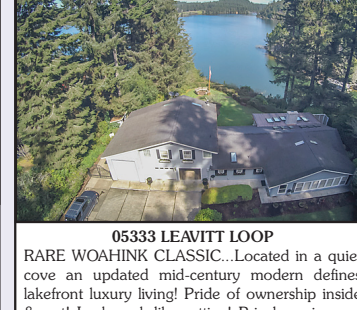
05333 LEAVITT LOOP RARE WOAHINK CLASSIC...Located in a quiet cove an updated mid-century modern defines lakefront luxury living! Pride of ownership inside & out! Lush park like setting! Priceless views of Woahink Lake! Dock/boathouse access to the lake. Tasteful interior w/ inviting kitchen, formal dining room & spacious living room. Elegant master suite w/ bath & reading room lower and upper-level windowed porches offer beautiful lake views. $975,000 #11829 MLS#19019818