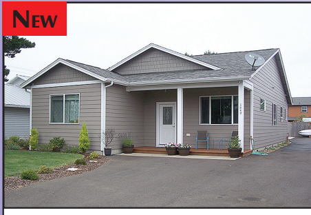
NEW 1649 23RD STREET LOCATION-LOCATION-LOCATION. In town beauty - 1748 sq. ft. of open living. 3 bedroom, 2 bath located near the schools and shopping. Bamboo floors, stainless steel appliances, large island, Corian countertops. Oversized bedrooms, master with walk-in shower and dual walk-in closets. Storage galore. RV parking. Hot tub, easy maintainable yard. Check this one out before it's gone. $332,000 #11881 MLS#19267676