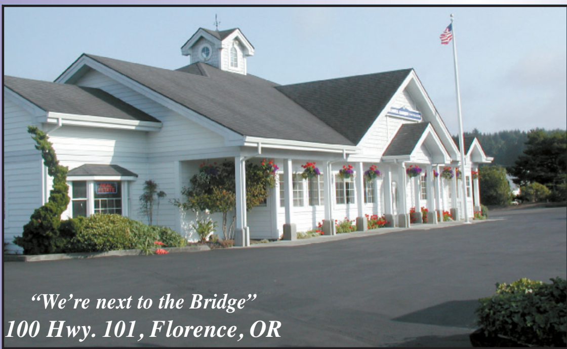
"We're next to the Bridge" 100 Hwy. 101, Florence, OR