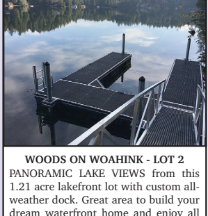
WOODS ON WOAHINK - LOT 2 PANORAMIC LAKE VIEWS from this 1.21 acre lakefront lot with custom all-weather dock. Great area to build your dream waterfront home and enjoy all that Woahink Lake has to offer...fishing, boating, water sports and more! All underground utilities available, septic approved and trail to the lake's edge and dock. $199,000 #11790 MLS#19573688