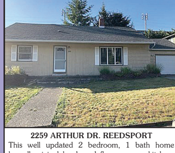
2259 ARTHUR DR. REEDSPORT This well updated 2 bedroom, 1 bath home has all original hardwood floors, newer kitchen, bathroom, tank-less hot water heater and a stunning park like back yard. It also has a partially finished upstairs with an almost finished bathroom bedroom that is not included in the square footage for future use and potential sweat equity. $191,000 #11861 MLS#19012302