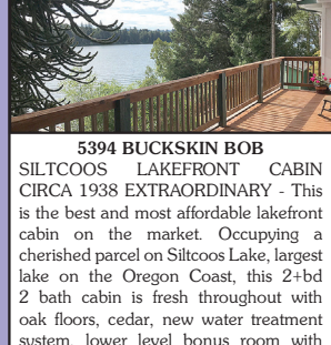
5394 BUCKSKIN BOB SILTCOOS LAKEFRONT CABIN CIRCA 1938 EXTRAORDINARY - This is the best and most affordable lakefront cabin on the market. Occupying a cherished parcel on Siltoos Lake, largest lake on the Oregon Coast, this 2+bd 2 bath cabin is fresh throughout with oak floors, cedar, new water treatment system, lower level bonus room with extra bath, 4x6 acid washed concrete floors, lake's edge boathouse and a huge magnolia and monkey puzzle tree. Hurry on this one time to enjoy beautiful Siltoos Lake this summer and fall. $359,000 #11822 MLS#19043807