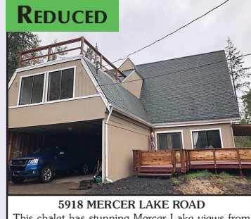
REDUCED 5918 MERCER LAKE ROAD This chalet has stunning Mercer Lake views from every level. It has a new very private driveway leaving you nestled in the woods, dramatic exposed beam vaulted ceiling, well maintained interior and an amazing roof top deck with extensive exterior updating. Great family home or very private weekend getaway. $324,900 #11779 MLS#19627910