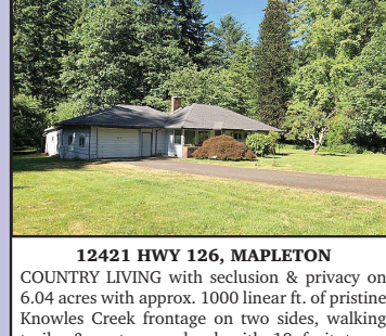
12421 HWY 126, MAPLETON COUNTRY LIVING with seclusion & privacy on 6.04 acres with approx. 1000 linear ft. of pristine Knowles Creek frontage on two sides, walking trails, & mature orchard with 18 fruit trees. Horse property and a large stand of primarily Douglas Fir. Large Det-Shop with additional RV port. Featuring a 3 bdrm, 1 bath home with an additional bath in the 2 car garage + pasture, & outbuildings. $279,000 #11851 MLS#19293993