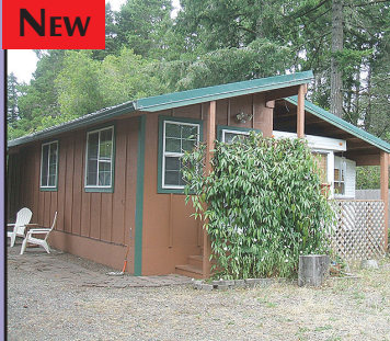
NEW 17 REDWOOD STREET Cute and clean home w/ roomy addition furniture included - move in ready. Laundry in separate out building. Shop/storage building at rear of home deck area off addition - RV hookups w/ large parking area for RV. $135,000 #11880 MLS#19254261