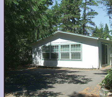
134 DRIFTWOOD DRIVE 2004 Doublewide manufactured home in a gated community. Well maintained, ready for new owners. Low maintenance yard, metal storage shed, paved driveway and close to the common area for laundry, post office, clubhouse + office. $185,000 #11875 MLS#19143851