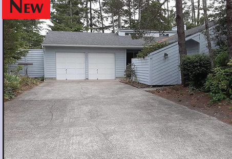
NEW 2240 23RD STREET Summerset Estates. Great location, private setting. 0.22 acre lot, 3 bedrooms, 2 baths, double car garage. Inside laundry with sink, solar tubes, and fireplace. Walking distance to shopping and restaurants. Come see this before its gone. $299,380 #11884 MLS#19119119