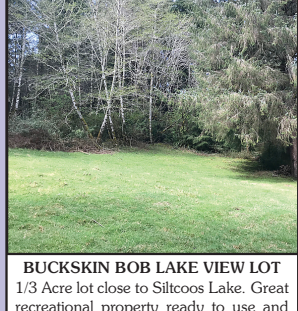
BUCKSKIN BOB LAKE VIEW LOT 1/3 Acre lot close to Siltoos Lake. Great recreational property ready to use and enjoy. Septic and power installed. Gentle rolling terrain and canopy of trees to the west for privacy. 2nd story lake view potential. Close to fishing, trails, and all Siltoos Lake activities. $104,900 #11811 MLS#19066250