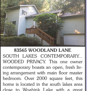
83565 WOODLAND LANE SOUTH LAKES CONTEMPORARY... WOODDED PRIVACY. This one owner contemporary boasts an open, fresh living arrangement with main floor master bedroom. Over 2000 square feet, this home is located in the south lakes area close to Woahink Lake with a great surrounding forested setting offering privacy & tranquility. Rear deck with awning, firepit & hot tub provides wonderful outside living. Needs a little TLC. Hurry on this one! $465,000 #11750 MLS#18143696