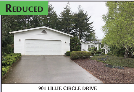
REDUCED 901 LILLIE CIRCLE DRIVE Excellent quality built manufactured 2235 SF home located in the 55 & older premier community of Florentine Estates. Kitchen & formal dining area w/ lots of morning light. Large gourmet kitchen w/ solid oak cabinets, center island/eating bar & lots of counter & cabinet space; counter depth. Propane fireplace in living rm; grand mstr suite w/ sitting rm, den/office. Complex origami ceilings. Park-like setting w/ excellent landscaping. $355,900 #11817 MLS#19187183