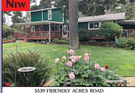
NEW 5539 FRIENDLY ACRES ROAD BEAUTIFUL HOME AND GROUNDS 2.10 acres of privacy. 3 bedroom/2 Bath, Ductless split heat pump, exposed beam ceilings, newer pellet stove, some recent updating and a beautiful sunroom. Covered, porch and decks, fenced, 2 car detached garage w/adjacent shop, RV carport with hook-up 20x40, 2-car carport 24x28. Very well maintained home. $388,000 #11883 MLS#19183980