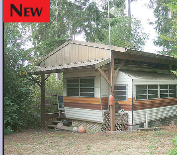
NEW 228 HORSE SHOE BEND Great weekend getaway. Travel trailer is older and needs some TLC. Clubhouse laundry & mailroom only a block away. Dues are currently $175/mo but will increase to $185/mo as of 1-1-2020. Buyer to pay $25.00 transfer fee at COE. $85,000 #11882 MLS#19583319