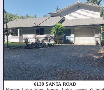
6130 SANTA ROAD Mercer Lake View home. Lake access & boat dock. Open floor plan. 2 bedrooms, 2 baths. Original owners of a custom Tom Balcolm built home. Vaulted ceilings, recessed lighting, & newer pellet stove. View windows, custom cabinetry, hardwood floors. Covered decks, Private hot tub deck. Over-sized 1-car garage. Storage Shed $448,000 #11878 MLS#19062400