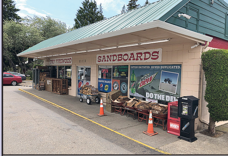
88150 HWY 101 Great family business that has been owned by the same owner for 20 years. A great opportunity for a fun, profitable, turn key business. Great building with lots of upgrades, roof, awning, ductless heat pump, CCTV, some fridge cases. Separate wood business can be purchased with store. (See LA for information) $450,000 #11865 MLS#19563227