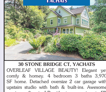
YACHTS 30 STONE BRIDGE CT, YACHTS OVERLEAF VILLAGE BEAUTY! Elegant yet comfy & homey. 4 bedroom 3 baths 3,970 SF home. Detached oversized 2 car garage with upstairs studio with bath & built-ins. Awesome soaring ceiling in LR with stone gas inserts FP. 500 gal underground propane tank ensures your cozy fire year round. Light, bright kitchen with conveniently located pantry/laundry room. Custom library with floor to ceiling bookcases & SO MUCH MORE. OUTSTANDING VALUE! $549,500 #11850 MLS#19200658