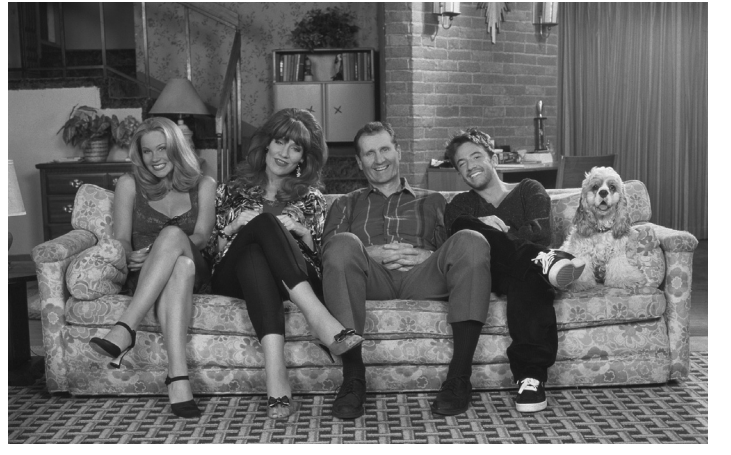
"Married...With Children" airs weeknights on getTV.

for everyone, from sitcoms to Westerns to crime dramas to variety shows. One of the most popular diginets, getTV, anchored by Sony Pictures Entertainment's vast library, airs such programs as "The Unit," "Married...With Children," "Good Times," "Amen," "The Steve Harvey Show," "Walker, Texas Ranger," "The Johnny Cash Show," "Hot in Cleveland" and "All in the Family." Other major diginets include MeTV, Comet, Antenna TV, Cozi TV, Escape, Grit and Laff. No cable, satellite or Internet connection is necessary.