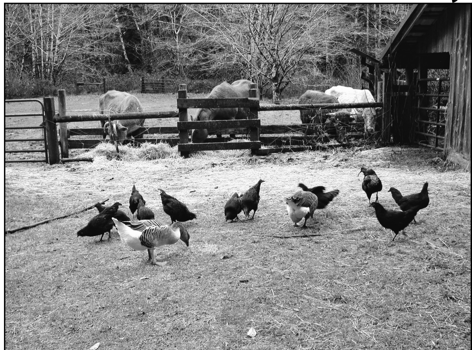
Visitors to the Yachats River Valley Farm Tour will get to view livestock, gardens, greenhouses and barns on an 11-mile stretch of Yachats River Road. People are invited to bring picnics and relax for a while.

Visitors are invited to bring a picnic lunch and stay awhile. Refreshments will be available at several sites.