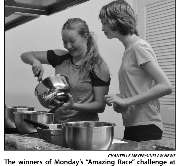
the Teen Center were the first to make their own whipped cream in the recently outfitted Boys & Girls Club kitchen. each other. It's not my kids or his kids The eight garden beds contain pumpkins, corn, beans, flowers, cilantro,

During the Amazing Race, the students were required to help with the Teen Center's daily garden harvest.