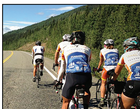
Members of the Texas 4000 cycle from Austin, Texas, to Anchorage, Alaska, in an effort to improve cancer awareness and education.

The Texas 4000 bicyclists will be arriving in Florence again this Sunday July 7th around 3:00pm coming in from Eugene. St. Andrews Episcopal Church is hosting them with the help of many other community supporters. This is the 14th year the longest charity ride in the world is stopping here in Florence. There are 10 guys and 18 gals in this group each biking 4000+ miles from Austin, TX to Anchorage, AK often in many challenging conditions and terrains. Their mission is to spread HOPE for those suffering with cancer, KNOWLEDGE on prevention of cancer and CHARITY by raising funds for a cancer cure. Thirteen homes will be