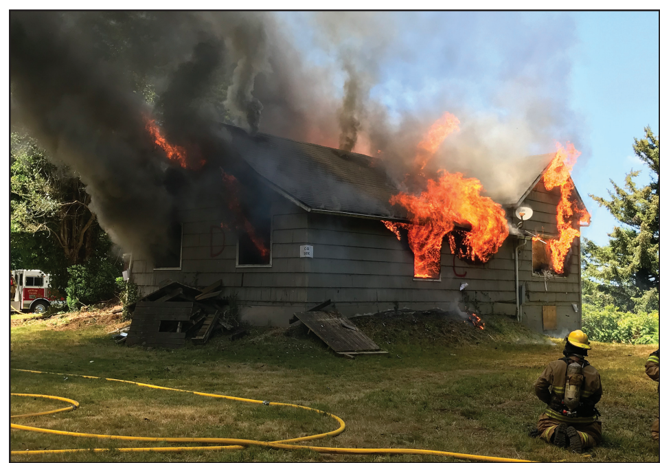
Siuslaw Valley firefighters learned from eight different fires set in this donated Burn to Learn house.