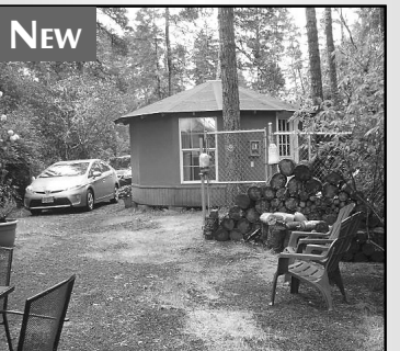
91 OUTER DRIVE

COUNTRY HILLTOP PRIVACY - Spacious tri-level home with ocean & territorial views, out of the wind & fog. Huge living room and modernized country kitchen. Heat Pump. 3 decks for outdoor living and entertaining. Enjoy the peace & quiet of the North Lakes area, just 10 min utes from town in this 3,000+ square foot, 4+ bedroom country home. $384,500 #11784 MLS#19552202