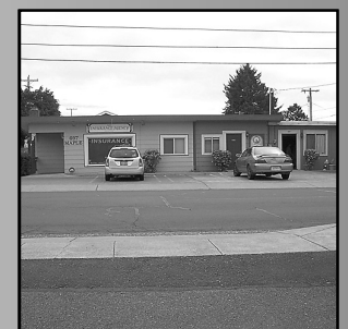
2 UNIT COMMERCIAL BUILDING Great location. Fully rented with ample parking. New vinyl flooring in 2017.

One of Florentine's finest homes, this luxurious estate-type Silvercrest Manor II has undergone an extensive interior & exterior remodel. Oversized rooms with an open and airy feel, this home is move-in ready. All the work has been done - ready for you to enjoy. Backs to common area for privacy. Work bench in oversized garage w/ shop area. $430,000 #11823 MLS#19434722