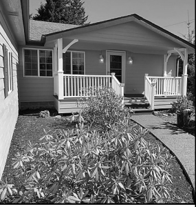
615 38TH PLACE

views from every level. It has a new ver private driveway leaving you nestled in the woods, dramatic exposed beam vaulted ceiling, well maintained interior and an amazing roof top deck with extensive exterior updating. Great family home or very private weekend getaway. $349,000 #11779 MLS#19627910