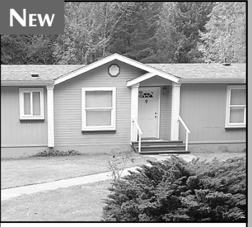
85170 DENTONS WAY

Large Outer Drive lot with storage shed, green house, and the only yurt in Coast Village. Great for RV'ers or develop into your own spot on the coast for full-time living. Gated community with many amenities. $110,000 #11837 MLS#19243280