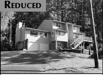
5854 MERCER LAKE ROAD

oom. 1 bath manufactured home with newer windows, metal roof and carpet. Home set back on the lot for more access to usable space in front. Partially fenced w/front gate, RV parking and a SHIPPING CONTAINER to use as you like. Appliances included. PLUS FULLY FUR-NISHED! (Washer-Dryer too!) Septic pumped/inspected by Wally's 2017. CASH ONLY! Cute. Affordable, Funky, Conveniently Available NOW! $154,900 #11761 MLS#18051064