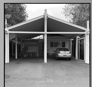
1600 RHODODENDRON DR.

50% OWNERSHIP THINK YOU CAN'T AFFORD A SEASIDE GETAWAY? THINK AGAIN! 50% OWNERSHIP in a gorgeous beach front vacation home, just steps to sand 2-story wall of windows immerses you in amazing ocean views from nearly every room, even the shower! Plenty of space to share in 2 BR/2 BA plus loft area. Fully furnished; ready for your beach vacation getaways. Brand new roof 2019. Deck railings lower for unobstructed ocean views. Make your dreams a reality! $298,000 #11813 MLS#19445498