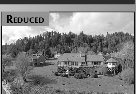
87995 RIVERVIEW AVENUE

Lovely home with newly refinished flooring in some areas. Clean and ready to welcome new ing on side of home to allow large RV. $349,900 #11838 MLS#19496680