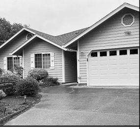
87651 WOODMERE WEST

SILTCOOS LAKEFRONT CABIN. RARE! Discover a bit of history. Siltcoos Lake, largest lake on the Oregor coast, provides stunning setting & play-ground for this circa 1938 cabin. Fresh and ready for you w/ hardwood floors charming and wood filled, 2 bed 2 bath, 1000+ sq ft, Vermont Casting woodstove, heat pump, carport & boat house on the lake's edge. Massive monkey tail & magnolia trees. Same loving owner for over 35 yrs. Priced to sell $369,000 #11822 MLS#19043807