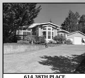
614 38TH PLACE

Beautiful private home on "a hill" in Florentine estates room to park boat or RV. Newly painted exterior. Two living spaces, and a formal dining room. The roof is 1999. Come see this awesom gated community if you are 55 or older! $348,000 #11705 MLS#18525370