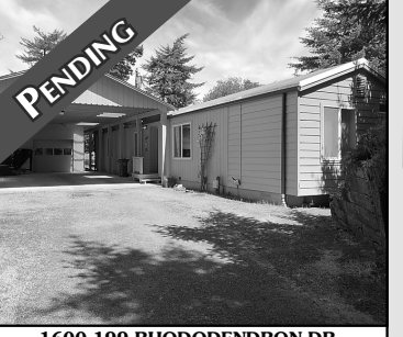
1600-199 RHODODENDRON DR.

setting near south lakes and out of the wind. Woodsy and cozy Craftsman-style 3 bedroom, 2 bath home on .45 acre. Fenced yard, 22 x 26 heated garage/shop, RV parking, small view of the lake with lake access nearby. Newer roof, windows, and paint. Wonderful front deck for barbecuing, relaxing or reading. Fruit trees in the rear yard and firepit. $298,500 #11832 MLS#19499190