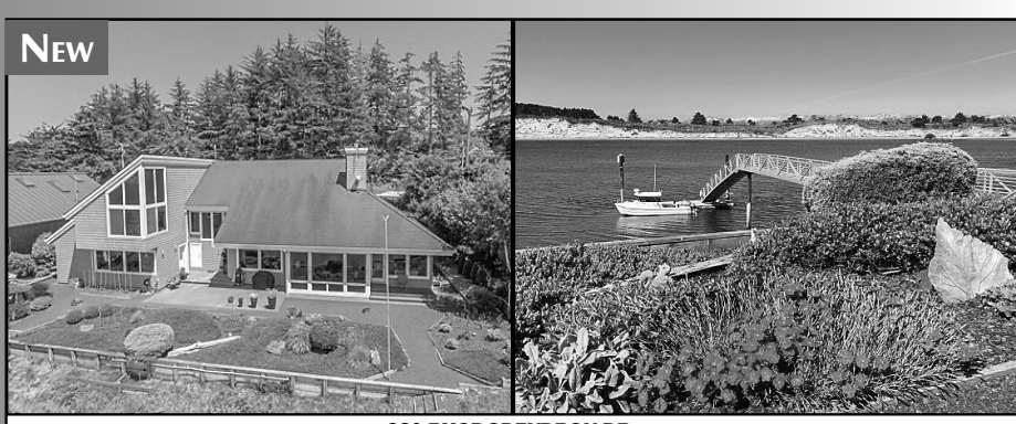
280 RHODODENDRON DR.

Very rare in town architecturally designed home on the river w/ a 30 ft dock. Throughout the home are custom touches from solid cherry cabinets, maple floors that radiate heat, to Brazilian tilework. On each floor are ensuite bedrooms and exquisite views from almost every room including the 505 sq ft workshop/studio/bonus room. By appt only. You won't be disappointed. $825,000 #11839 MLS#19013331