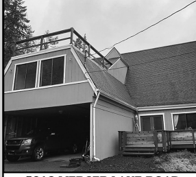
5918 MERCER LAKE ROAD

views from every level. It has a new ver private driveway leaving you nestled in the woods, dramatic exposed beam vaulted ceiling, well maintained interior and an amazing roof top deck with extensive exterior updating. Great family home or very private weekend getaway. $349,000 #11779 MLS#19627910