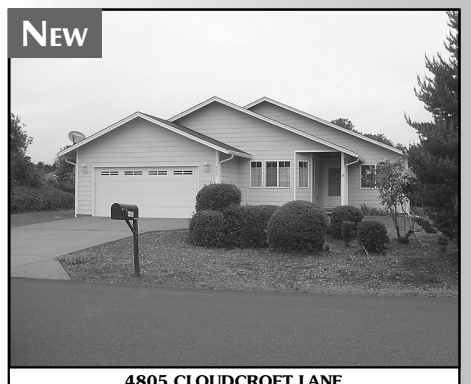
4805 CLOUDCROFT LANE

Very rare in town architecturally designed home on the river w/ a 30 ft dock. Throughout the home are custom touches from solid cherry cabinets, maple floors that radiate heat, to Brazilian tilework. On each floor are ensuite bedrooms and exquisite views from almost every room including the 505 sq ft workshop/studio/bonus room. By appt only. You won't be disappointed. $825,000 #11839 MLS#19013331