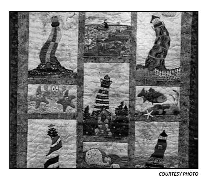
The 'Wonky Lighthouses' will be on exhibit with raffle tickets available for purchase.