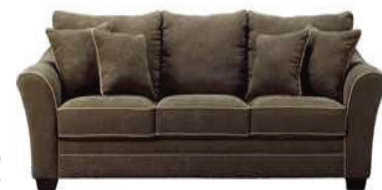
Couches & Sectionals Special Orders Accepted

Our Showrooms are full! New furniture weekly! Free Delivery!