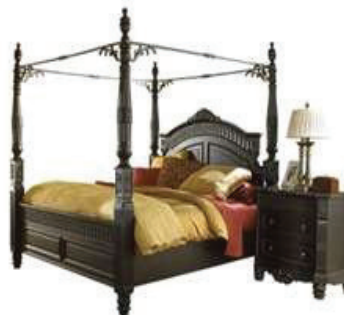
Bedroom Sets & Mattresses