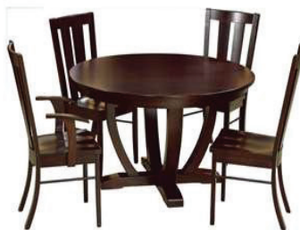
Dining Room Sets