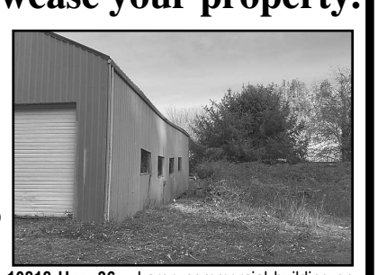
two city lots at the junction of Hwy 36 and 126 in Mapleton, a high traffic area. Metal building with high open beam ceiling, 3 phase power on one meter. Check with Lane County for zoning uses. Property is being sold "as is". $65,000. #2802-MLS