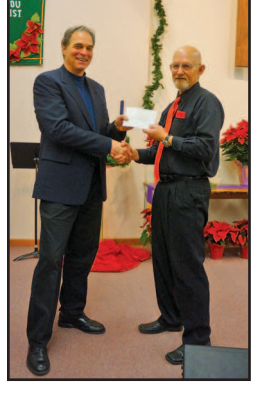
Community Chorus donates to Siuslaw music program INSIDE — A3