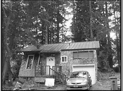
89248 SUTTON LAKE DRIVE This is a diamond in the rough cabin needing some TLC. Located in the woods with a backdrop of beautiful tall trees and a large yard; perfect for a garden, a shop and lots of toys. Fishing on Sutton Lake is just down the street. $120,000 #11758 MLS#18334947

5640 BUCK LAKE DR. Nice level corner lot in North Lakes area with direct access off of Hwy 101. Quiet street of well-maintained homes. Utility pole and septic in. Heceta PUD water at lot line. Manufactured home ready or build. $65,000 #11754 MLS#18063687