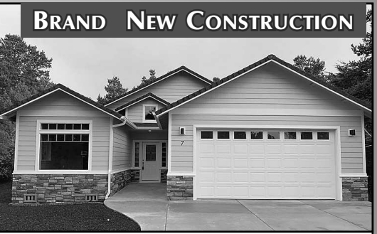
7 SEA WATCH PLACE New 3 bedroom 2 bath home in exclusive Sea Watch Estates. End of culde-sac location. Large open great room, granite countertops, bathroom vanity with lighted mirrors. Ductless heat pump. $379,000 #11760 MLS#18666219

THE BEST! This is the very best. Spectacular sunsets & views up & down the river & dunes to the west. Ultra custom home offers features found in no others. RV/boat garage, shop space & ample additional garage space. 3 bedroom, 3-1/2 baths with separate guest/caretakers quarters, chef's kitchen, low maintenance exterior, city utilities, hardwood, tile, granite, 2 heat pumps & so much more! Priced to sell. $559,000 #11762 MLS#18454413