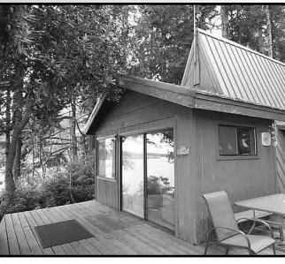
CHARMING CABIN ON THE LAKE! This property is closest to the ramp. Nice cedar interior. There is a wrap around porch to enjoy the lake view. 72-hour notice required for showings, contact listing agent for appointment. More pictures to come. $198,000 #11580 MLS#18614351

B/930 LARE POINT DR. Beautiful 1 level home in The Reserve at Heceta Lake. Brand new exterior paint in 2018. Ready to move into. This home has spacious rooms, custom tiled baths and large kitchen with commercial vent. Enjoy covered outdoor living out back with low maintenance landscaping. Filtered views of the lake. Fenced rear yard, perfect for dog area. Easy to show! Call today! $399,000 #11624 MLS#18024255