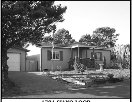
1791 SIANO LOOP Affordable in town home in Siuslaw Village. Built-in 1990 it has 2 bedrooms, 1 bath with a fenced yard, patio, landscaping, and attached greenhouse. Single car detached garage with shop addition. Check it out before its gone. $169,500 #11757 MLS#18067833

915 HEMLOCK STREET CENTRALLY LOCATED TOWNHOME STYLE CON-DO WITH ATTACHED FINISHED 2 CAR GARAGE - IN OYSTER COVE, corner of 9th and Hemlock; southwest exposure, best for great sunshine streaming through high windows! Easy access to post office, library, insurance offices, bank and grocery shopping clinics. Included are stainless kitchen appliances and washer-dryer. Other furniture negotiable. Lightly lived in home! Must see! $242,000 #11759 MLS#18651864