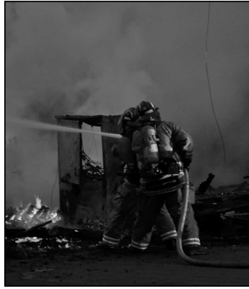
Siuslaw Valley firefighters spent several hours on the morning of Sept. 11 controlling a blaze at Sand Dunes Frontier.